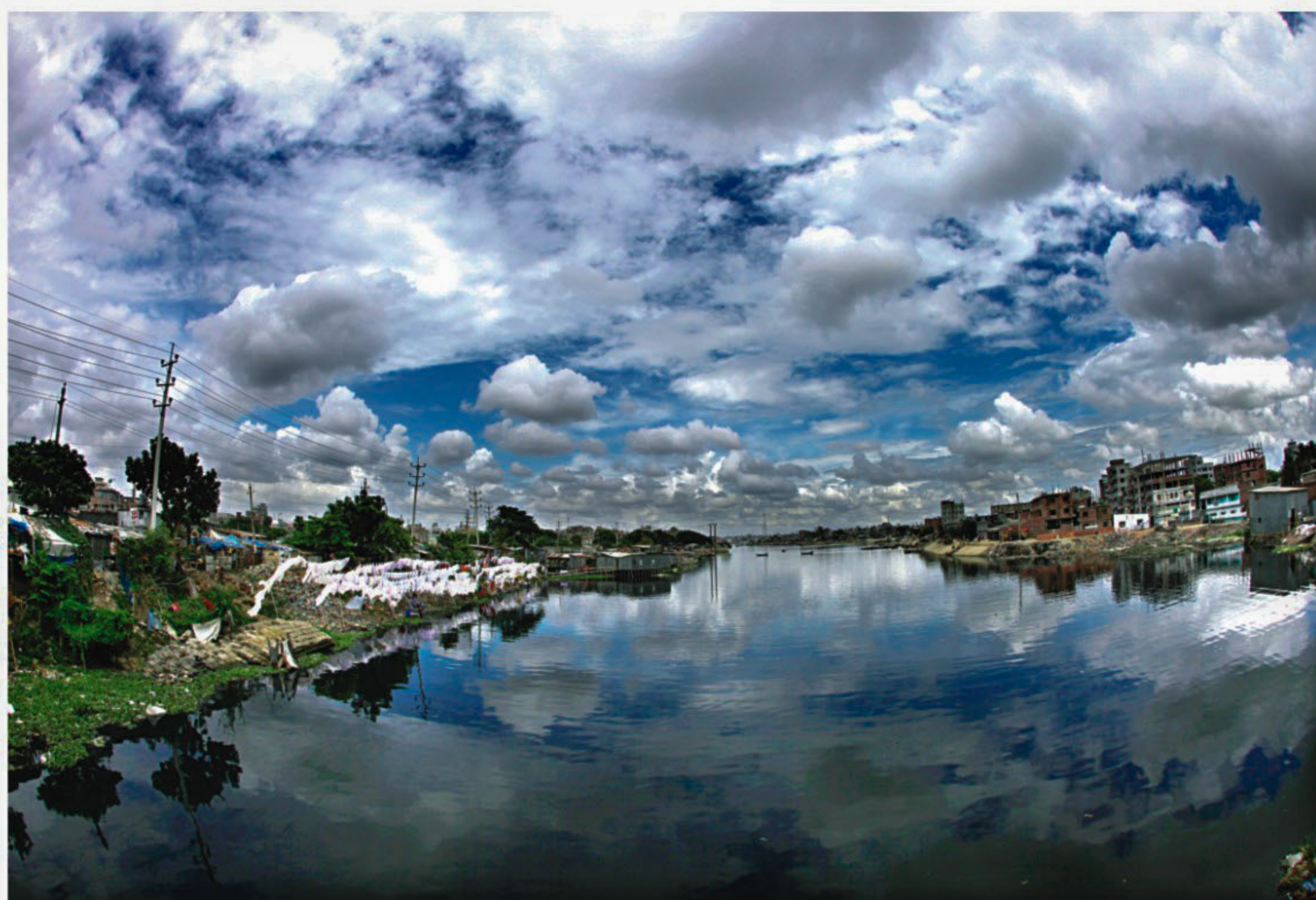
White clouds pervade blue sky in the capital, an unusual sight in peak of monsoon.