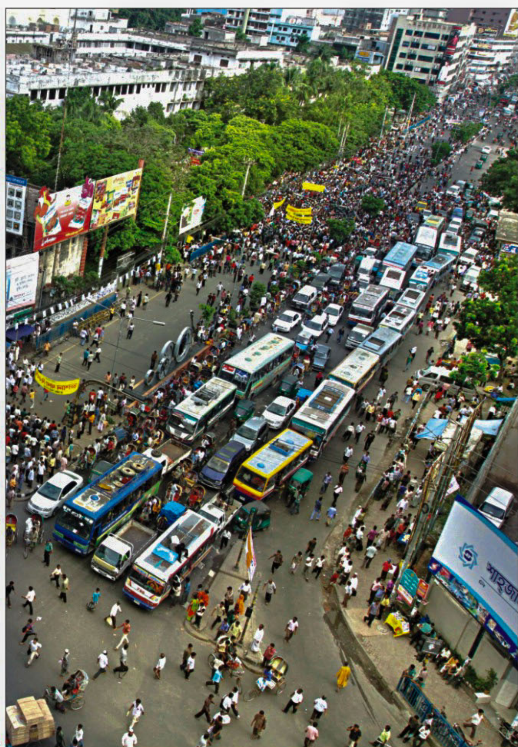
BNP holds a rally at Mukhtangon, blocking part of the busy road between Paltan intersection and Zero Point in the capital yesterday.