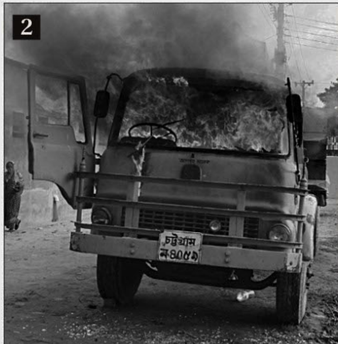
1) Police arrest three people on charge of shooting dead a person as locals caught them after the incident at Uttar Rampura in Halishahar of Chittagong city, 2) a truck used by the alleged killers set on fire by locals, and 3) Three alleged muggers caught by people at Jamal Khan in the city, yesterday.