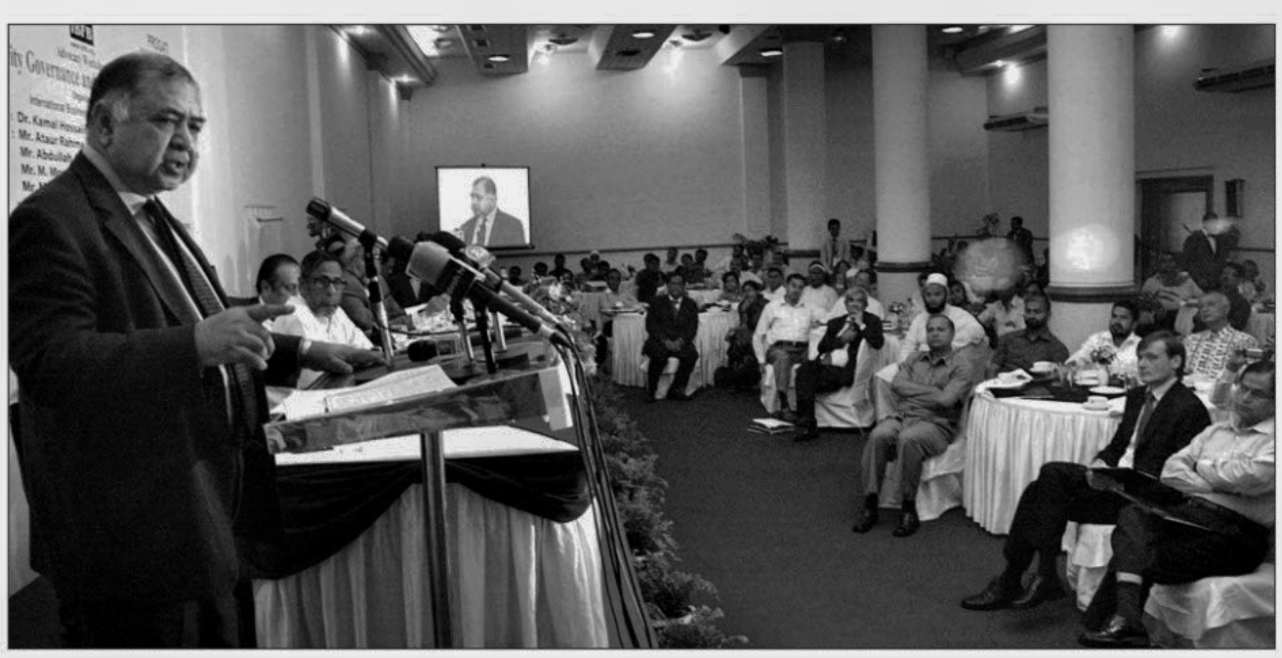
Dr Kamal Hossain addresses a workshop on "Improving City Governance and Private Sector Development" at Hotel Agrabad in Chittagong yesterday. (Story on Page 1)

and peace building efforts. In this context, she said Bangladesh has developed a national policy for rapid deployment of well-trained and well-equipped forces. She also mentioned the Centre of Excellence that Bangladesh established to train UN peacekeeping forces from home and abroad. The Foreign Minister emphasised Hanoi Plan of Action to implement the ARF vision statement, aimed at making ARF more action-oriented. A total of 27-member countries participated in the meet.