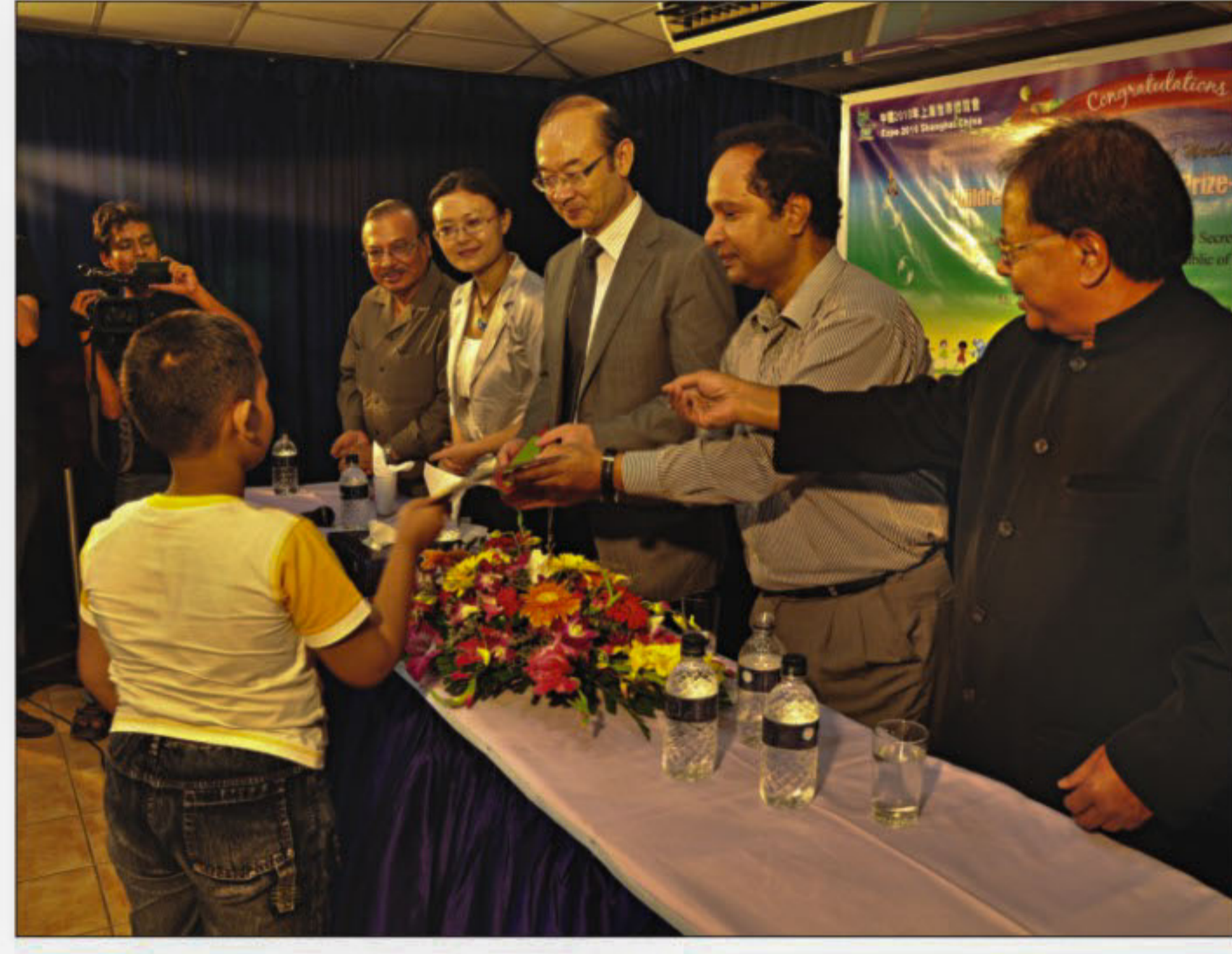
Winners receiving awards from the dignitaries.

The prize-winning paintings on the theme "Better City Better Life" will be sent to an international competition at Shanghai. If any of the competitors win, at least one will get the chance to go to Shanghai