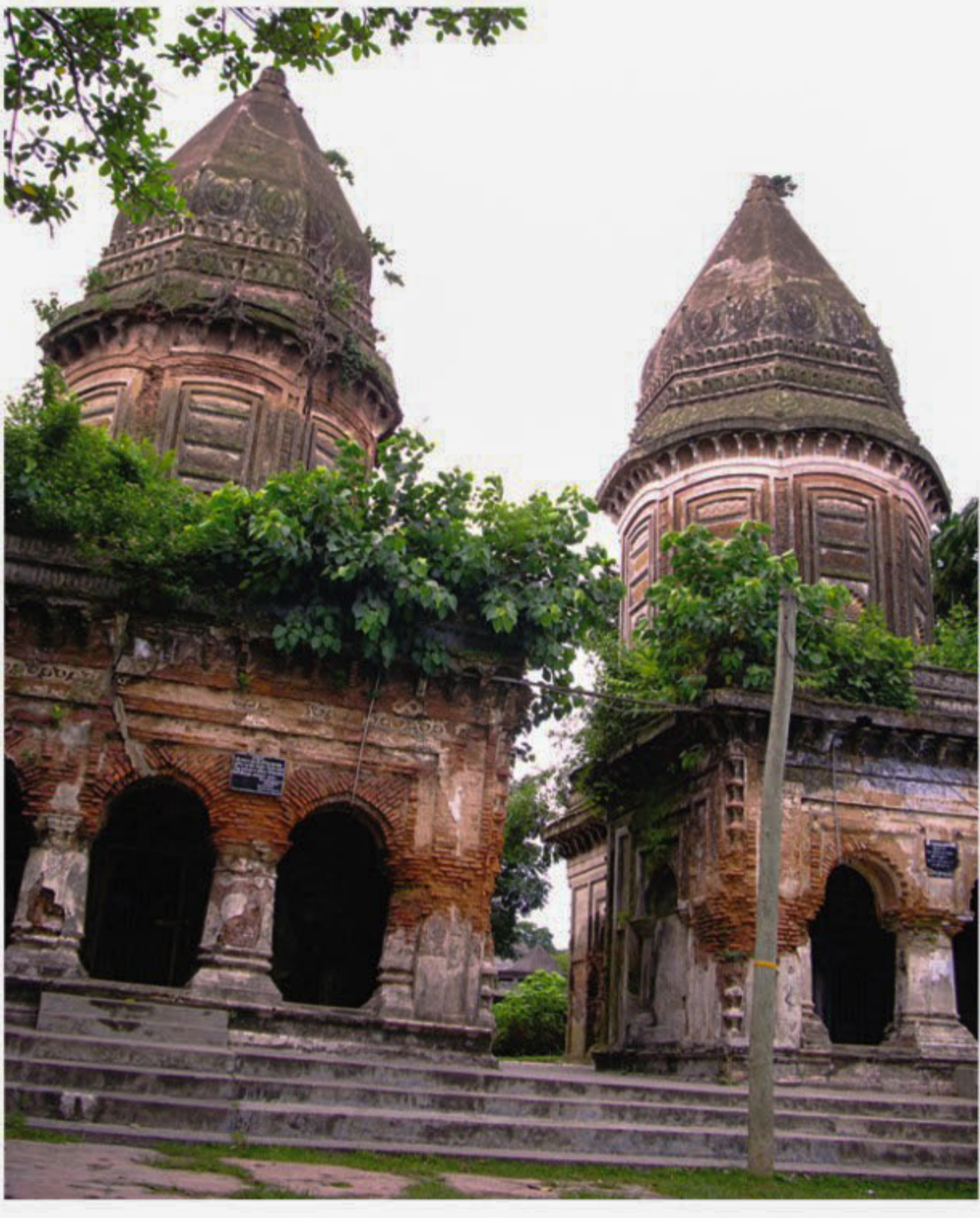
Of late, cracks have developed on the roofs and walls of the temples, threatening a collapse of the ancient structures.

The temples with a large pond in front of them is also known as Dakshineswar Temple where religious functions including Durga Puja, solemnising of marriages, sacrificial activities, especially on the occasion of Kali and