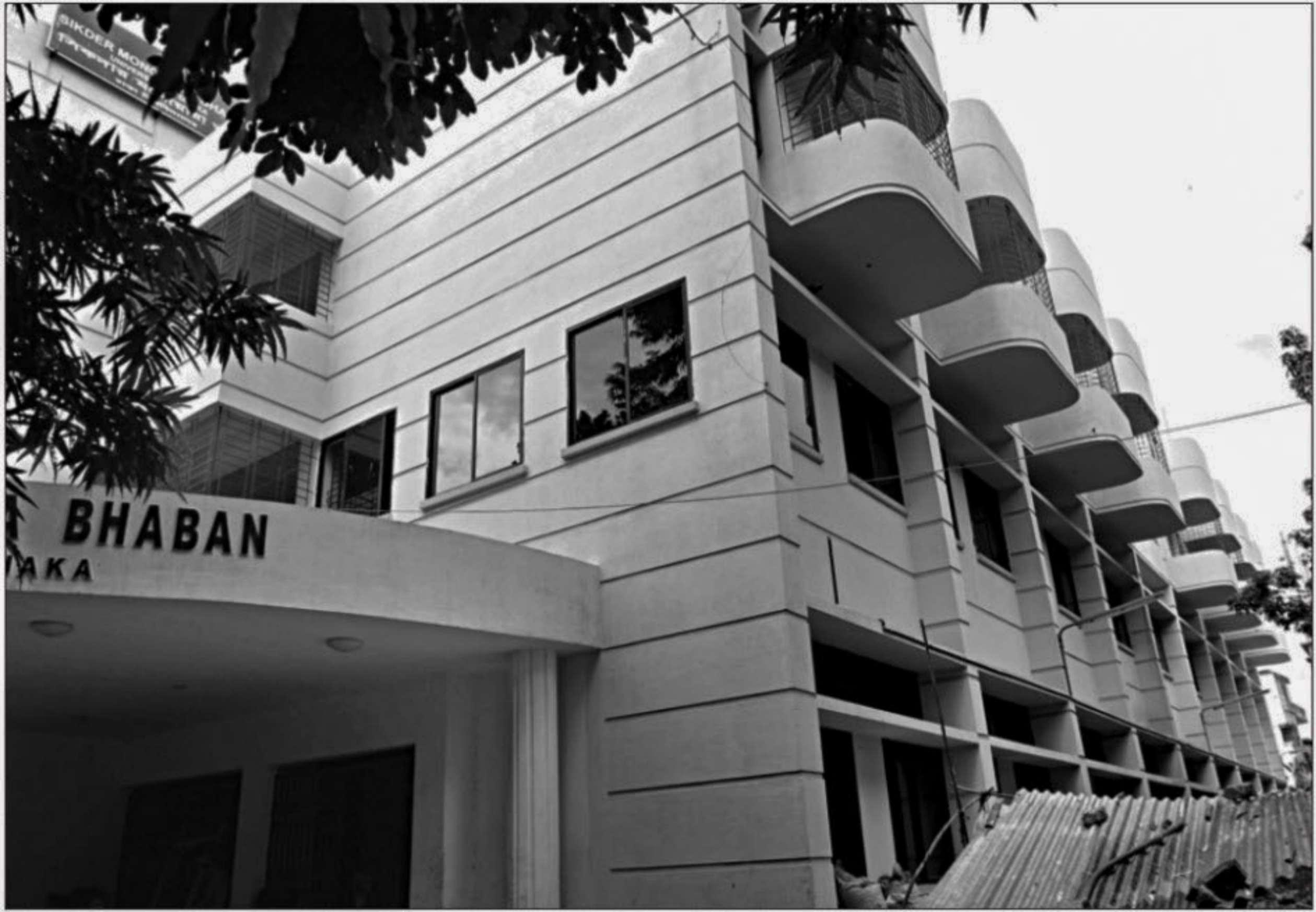
Sikder Monowara Bhaban at the Bangladesh-Kuwait Moitri Hall.

Whenever the price of jute fell, Tajuddin used to think of farmers' agony and say that the farmers should not be deprived of fair price of jute, he added.