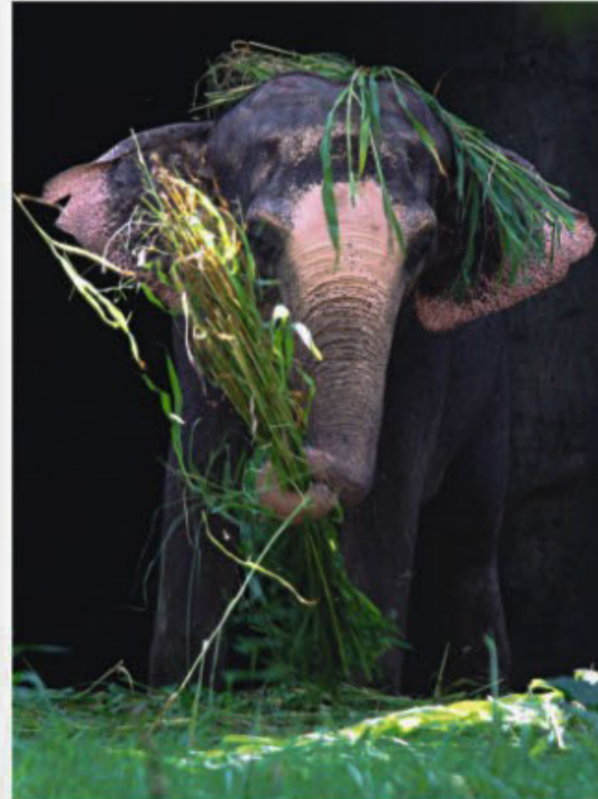
Like the ostrich, leopard, rhinoceros and the elephant, 18 species are spending their lives lonely in Dhaka Zoo, as they don't have mates. Some of these animals already have become aged and fallen sick.