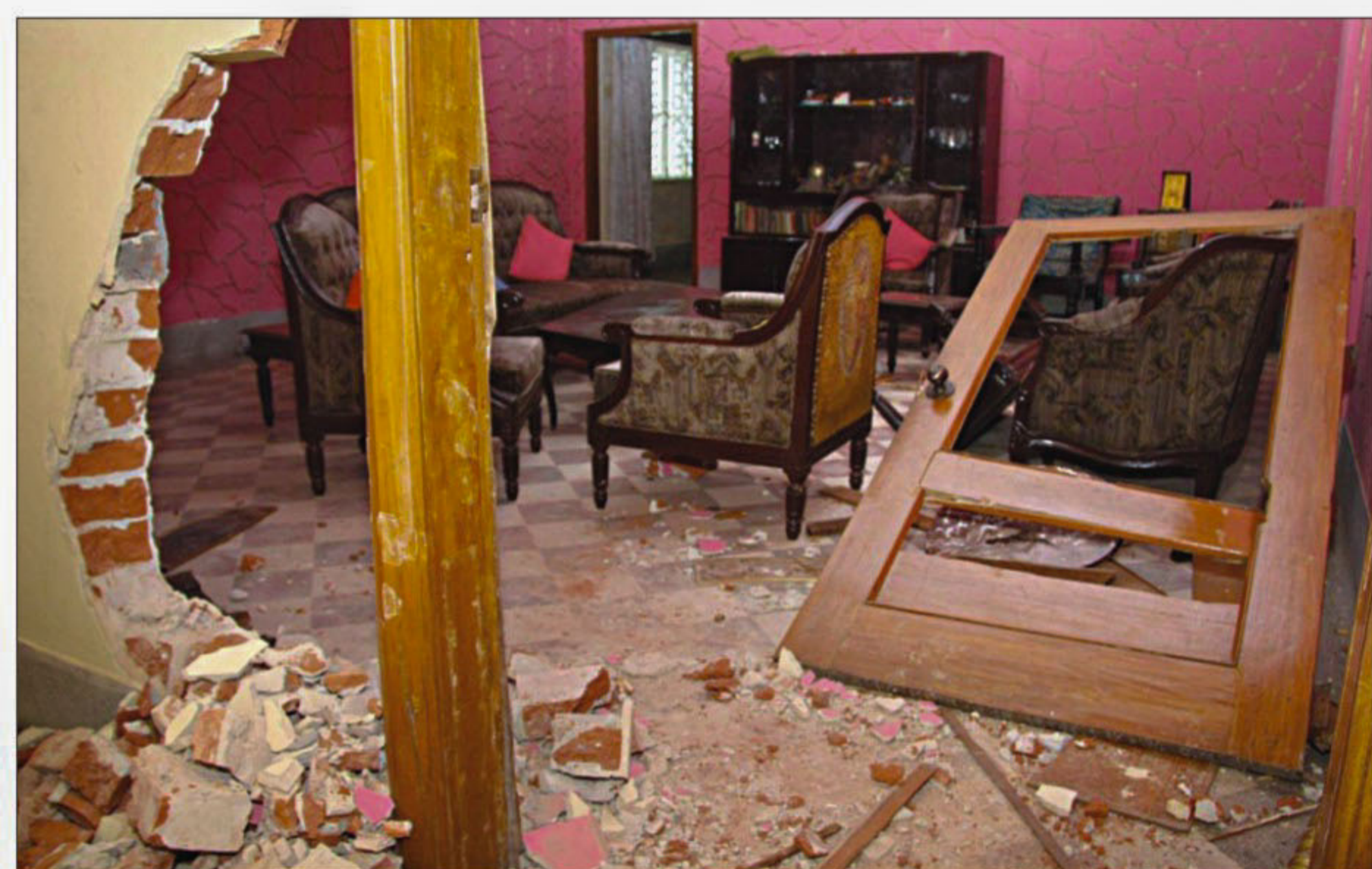
The residence of United Hotel owner Badiur Rahman vandalised during a clash between two groups following a dispute over the land in the port city yesterday