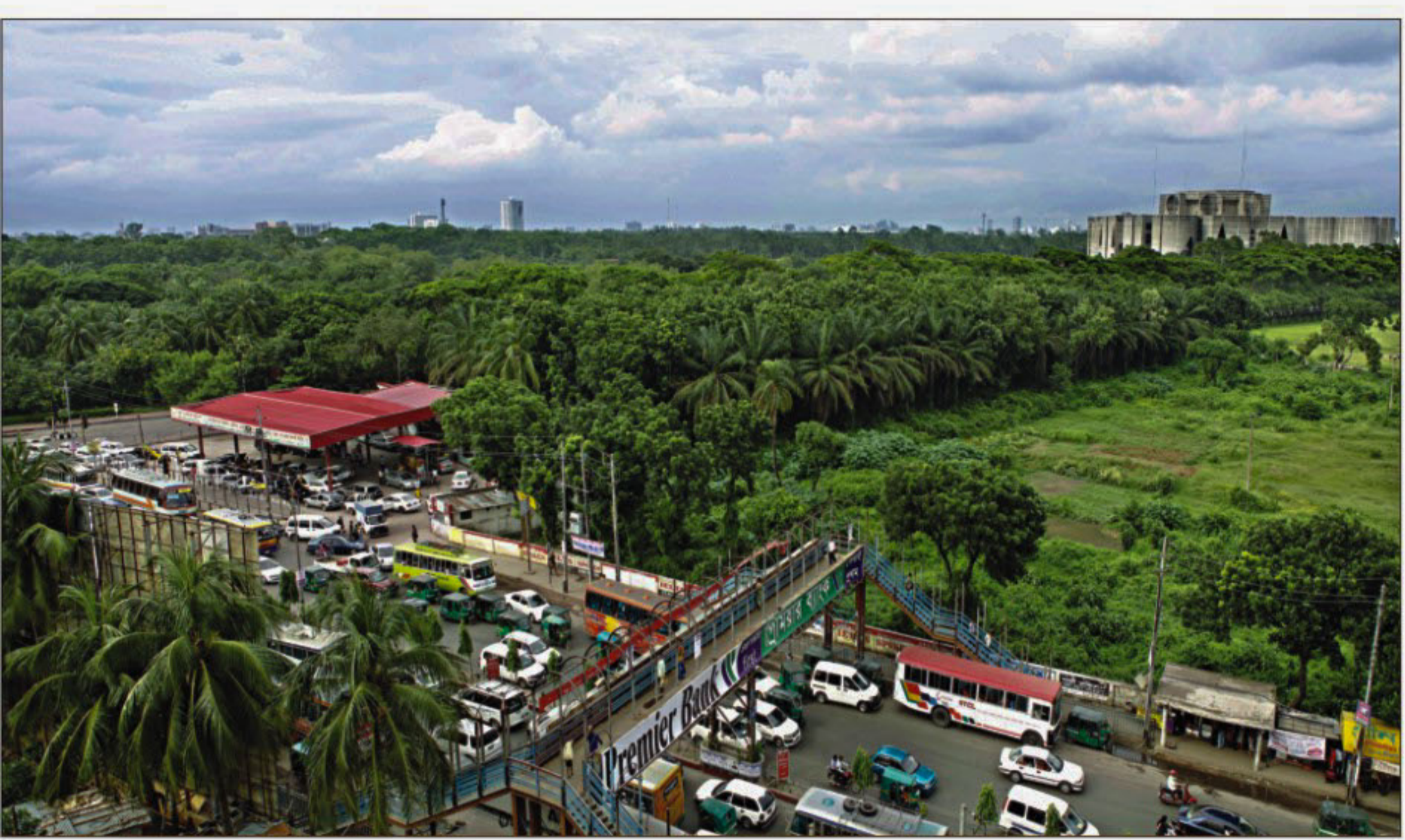
The High Court yesterday cleared the way for the government to remove this filling station near the Jatiya Sangsad Bhaban on the grounds of security.

Muttiah Muralidaran has said that retiring after taking his 800th wicket and helping Sri Lanka win his farewell Test, against India in Galle, was one of the greatest moments in his life. Murali's 800th was the last Indian wicket in the follow-on, after which Sri Lanka chased the target of 95 without losing a wicket.