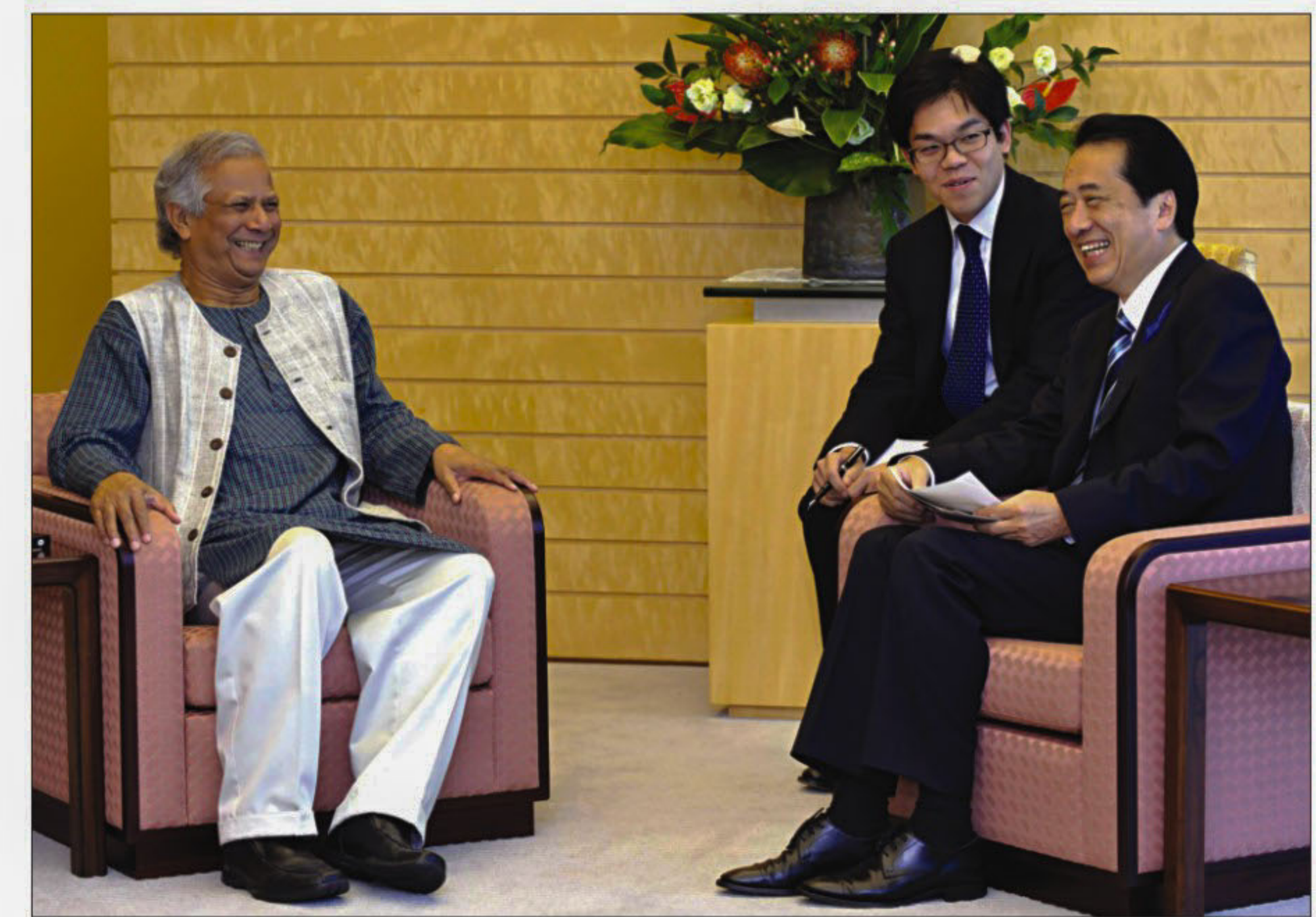
Nobel Laureate Prof Muhammad Yunus talks to Japanese Prime Minister Naota Kan at the latter's residence in Tokyo yesterday. They discussed application of the concept of social business in Japan and other countries.

Nobel Laureate Prof Muhammad Yunus yesterday called on Japanese Crown Prince Naruhito and Princess Masako at their invitation in Tokyo at the Imperial Palace. During the meeting, the Imperial couple discussed Prof Yunus's concept of social business and its potential role in solving some of society's most pressing problems, in Japan, Bangladesh and elsewhere, a release said yesterday. Princess Masako had expressed particular interest in meeting Prof Yunus since her father, Justice Hisashi Owada, a former diplomat and currently President of the International Court of Justice, is a long time friend of Prof Yunus.