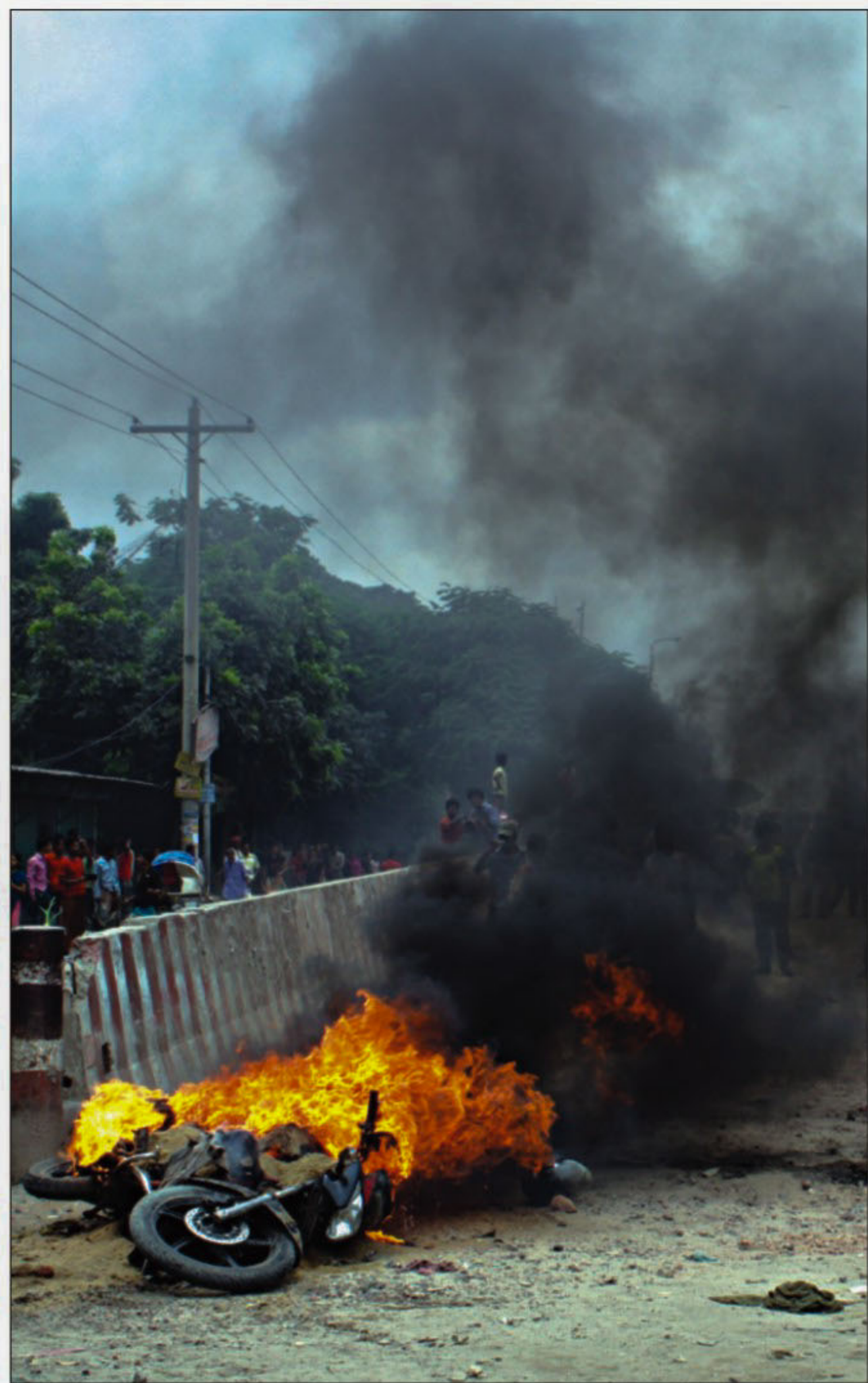
Drivers of autorickshaws and non-motorised vehicles torch a motorbike near Babubazar in the capital. They demand toll-free usage of Second Buriganga Bridge.