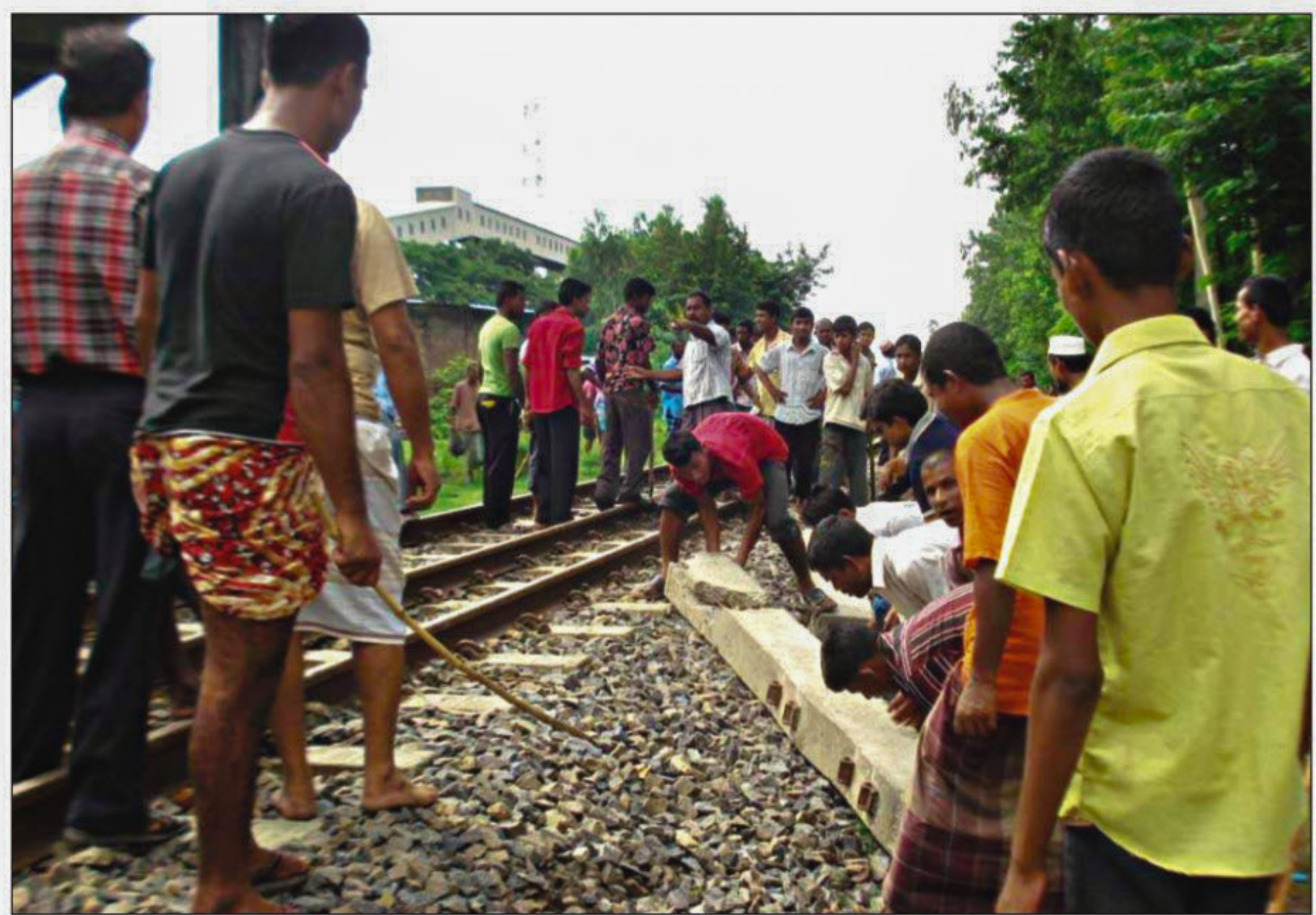
Villagers yesterday barricade the Dhaka-Dinajpur rail line at Barapukuria demanding rehabilitation and compensation for land subsidence due to underground coalmining.