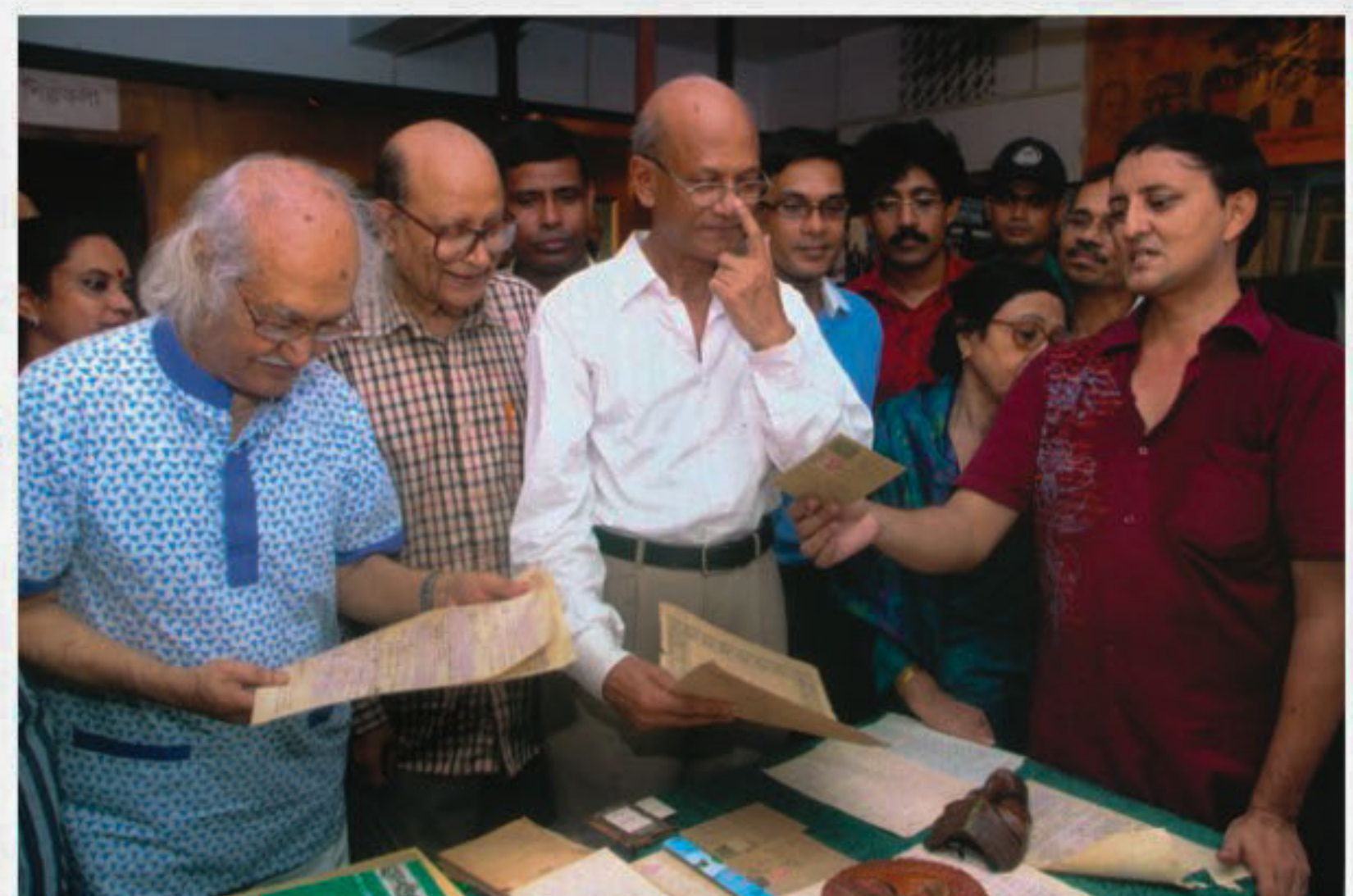
Education Minister Nurul Islam Nahid inaugurates the exhibition.

also on display. The exhibition also includes some rare photographs of Dr. Shahidullah with Rabindranath Tagore, Kazi, Motahar Hossain and other historic figures. Dr. Shahidullah was a polyglot and an expert in philology. Some of the manuscripts feature his handwriting in different languages. Some of the images show Dr. Shahidullah in Paris at different locations -- at his study room, with his family members and at the hospital where he was admitted before his death in 1969. The exhibition continues till July 30.