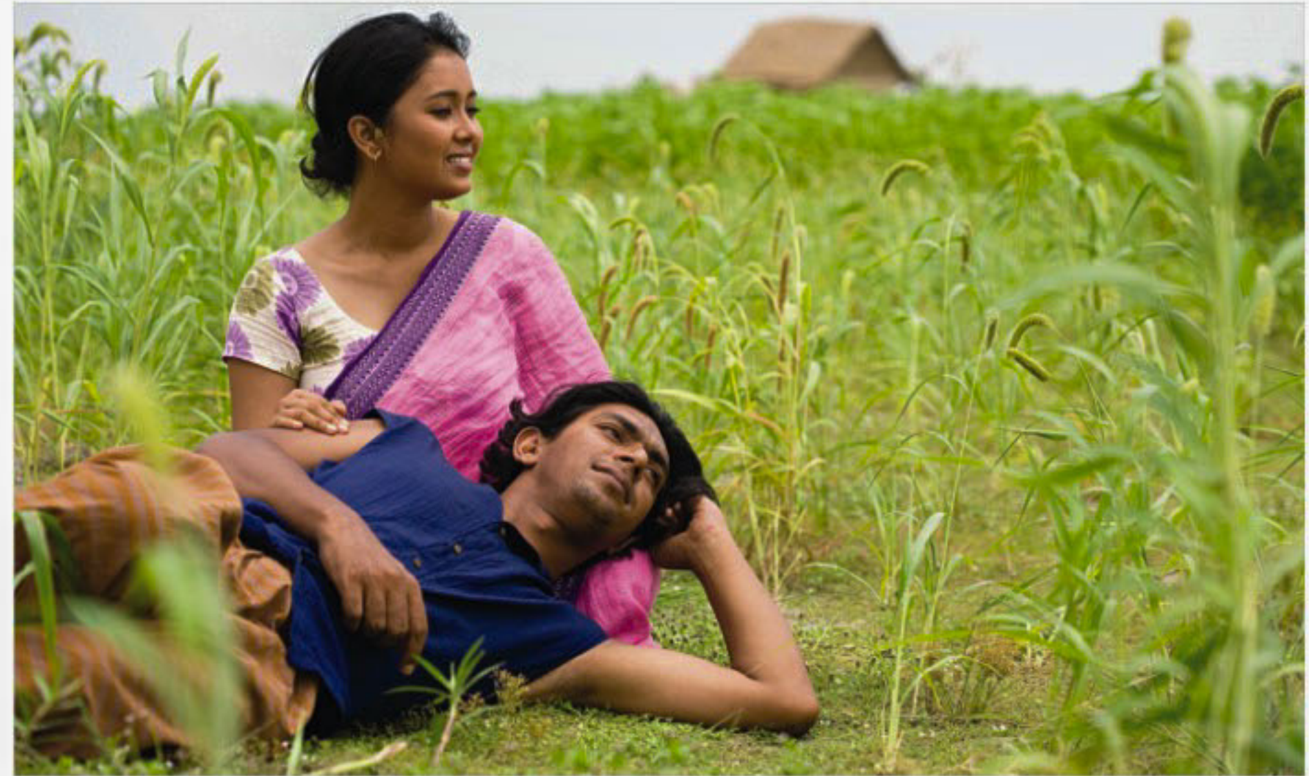
"Monpura" fetched me honours, appreciation of the audience and much more. Most importantly, it has provided me with a steady platform.

Everyday the sale is open from 9 am to 8:30 pm.