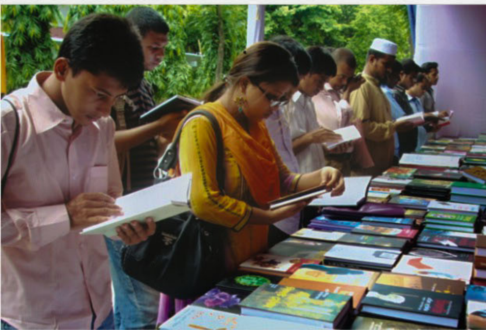
Collections of literary works by Rabindranath Tagore, Sharat Chandra Chattopadhyay, Manik Bandyopadhyay, Bibhutibhusan Bandyopadhyay and Jibanananda Das are available at the sale.

Publication house Oitijhya celebrates its 10th anniversary this year. To commemorate the occasion, Oitijhya has arranged a book sale at the Central Public Library premises, Shahbagh, according to a press release. The fortnight-long event began on July 15 and will continue till the end of this month. Special discounts are offered on books at the sale.