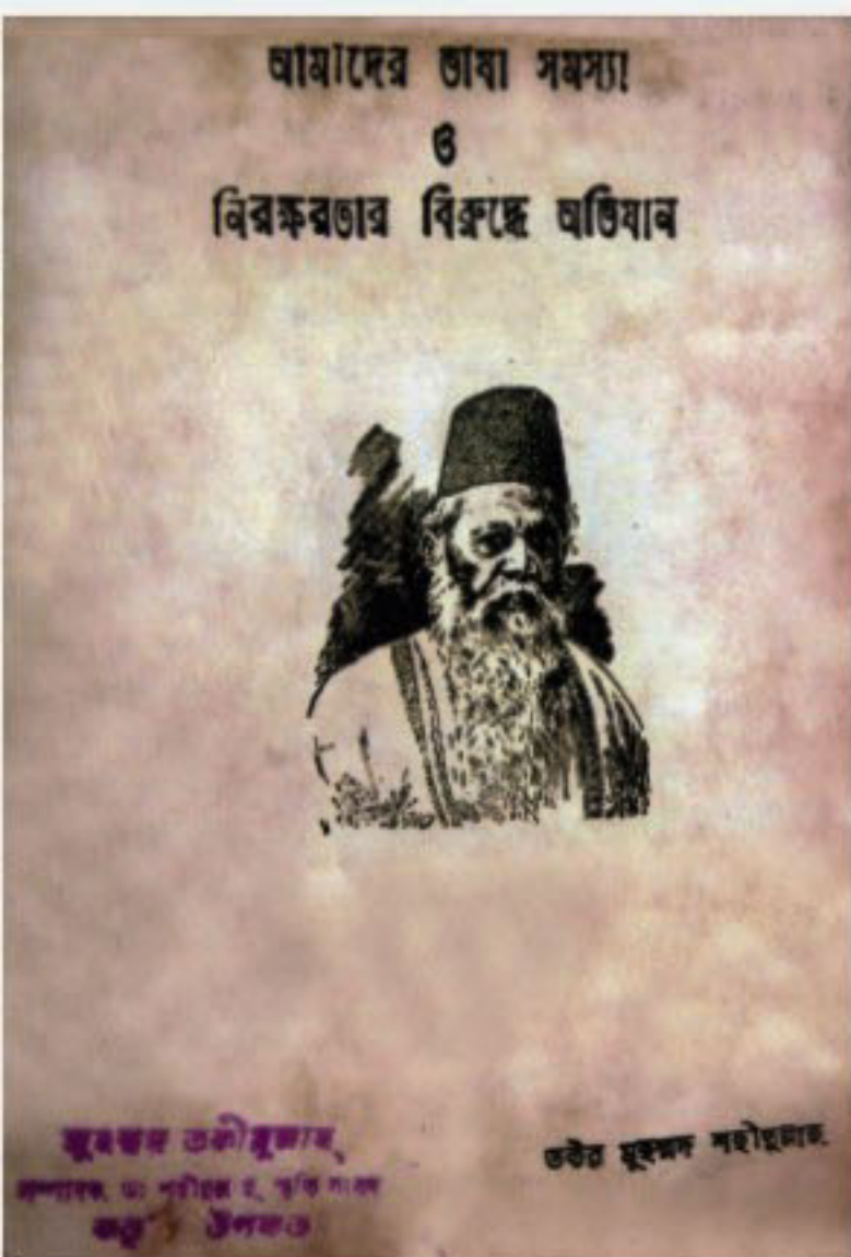
A cover jacket of a book on display.