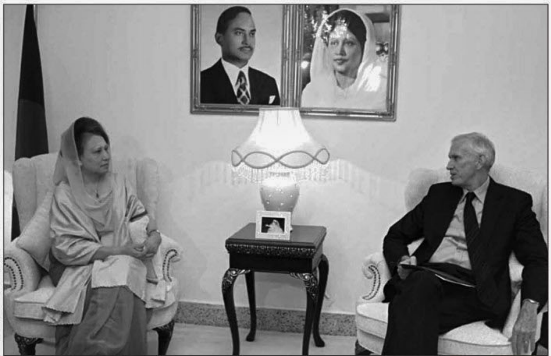
US Ambassador James F Moriarty calls on Leader of the Opposition in Parliament and BNP Chairperson Khaleida Zia at her Gulshan office in the city yesterday. (Story on Page 16)