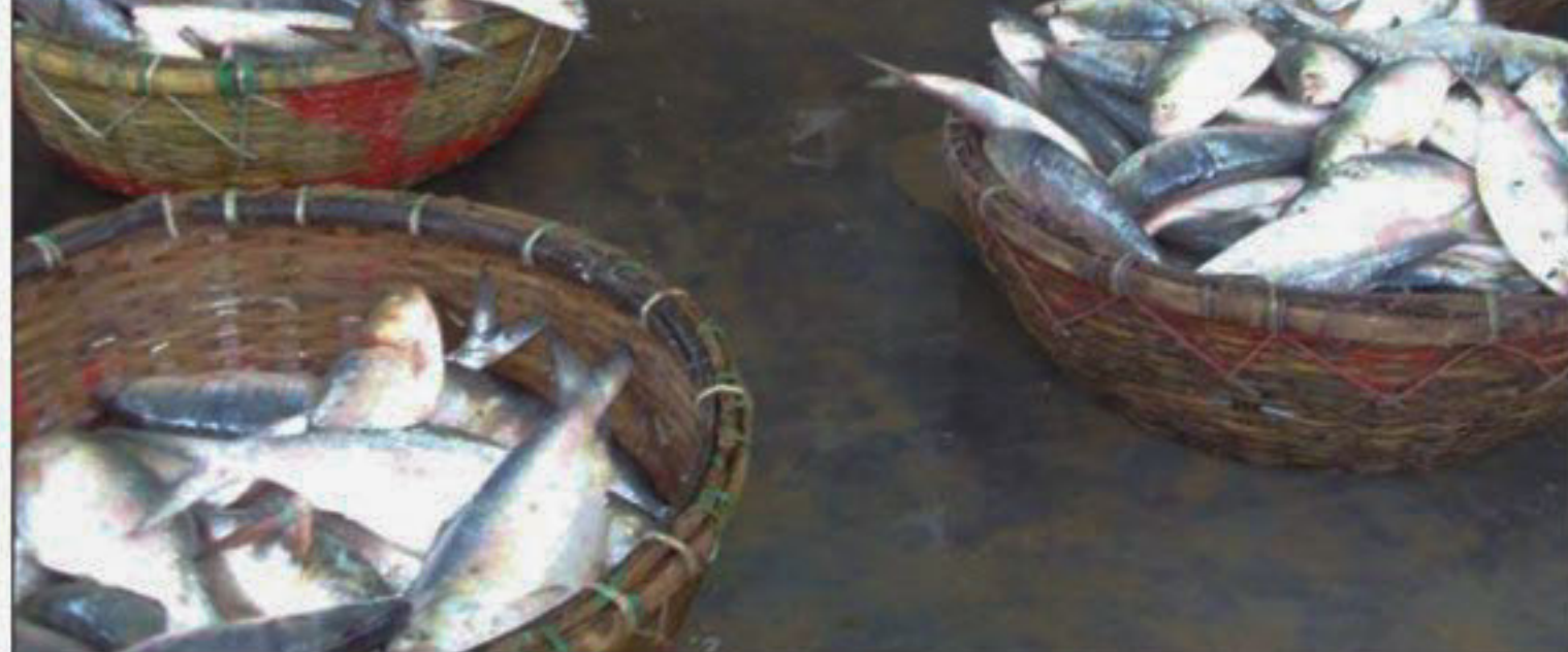
Fishermen engaged in netting hilsa in Ramnabad River in Galachipa upazila of Patuakhali district during the ongoing peak season. Inset, the wholesale fish market at Mohipur sees scanty supply of the popular fish as trawlers are bringing very small catches in the peak season this year.