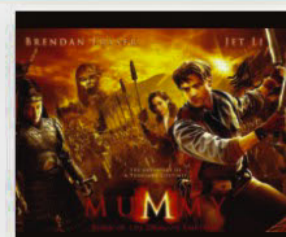
The Mummy: Tomb of the Dragon Emperor On HBO at 9:30pm Genre: Action/Adventure Cast: Brendan Fraser, Jet Li