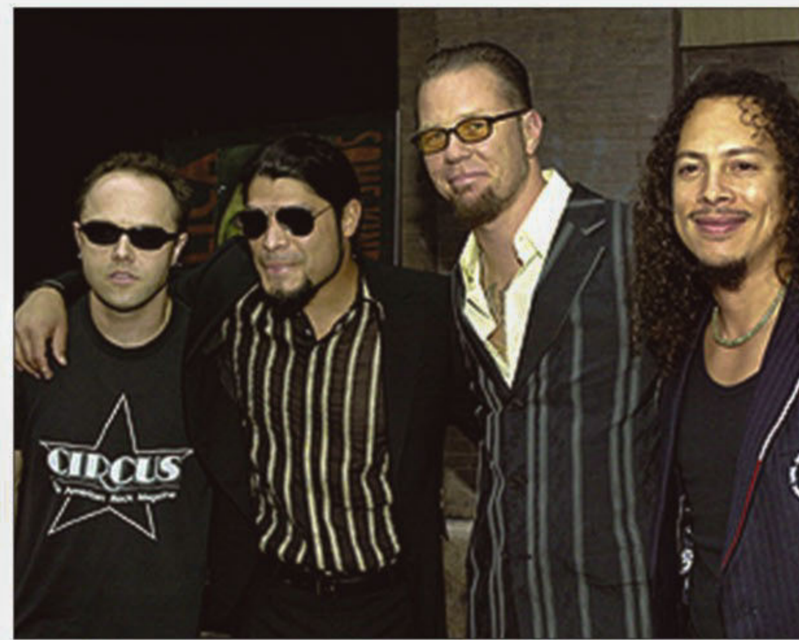
Metallica at the premiere of their film "Metallica: Some Kind of Monster" in New York in 2004.