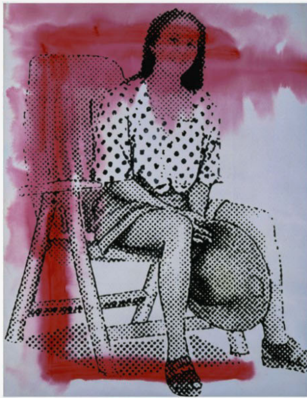
Artworks by Sigmar Polke.