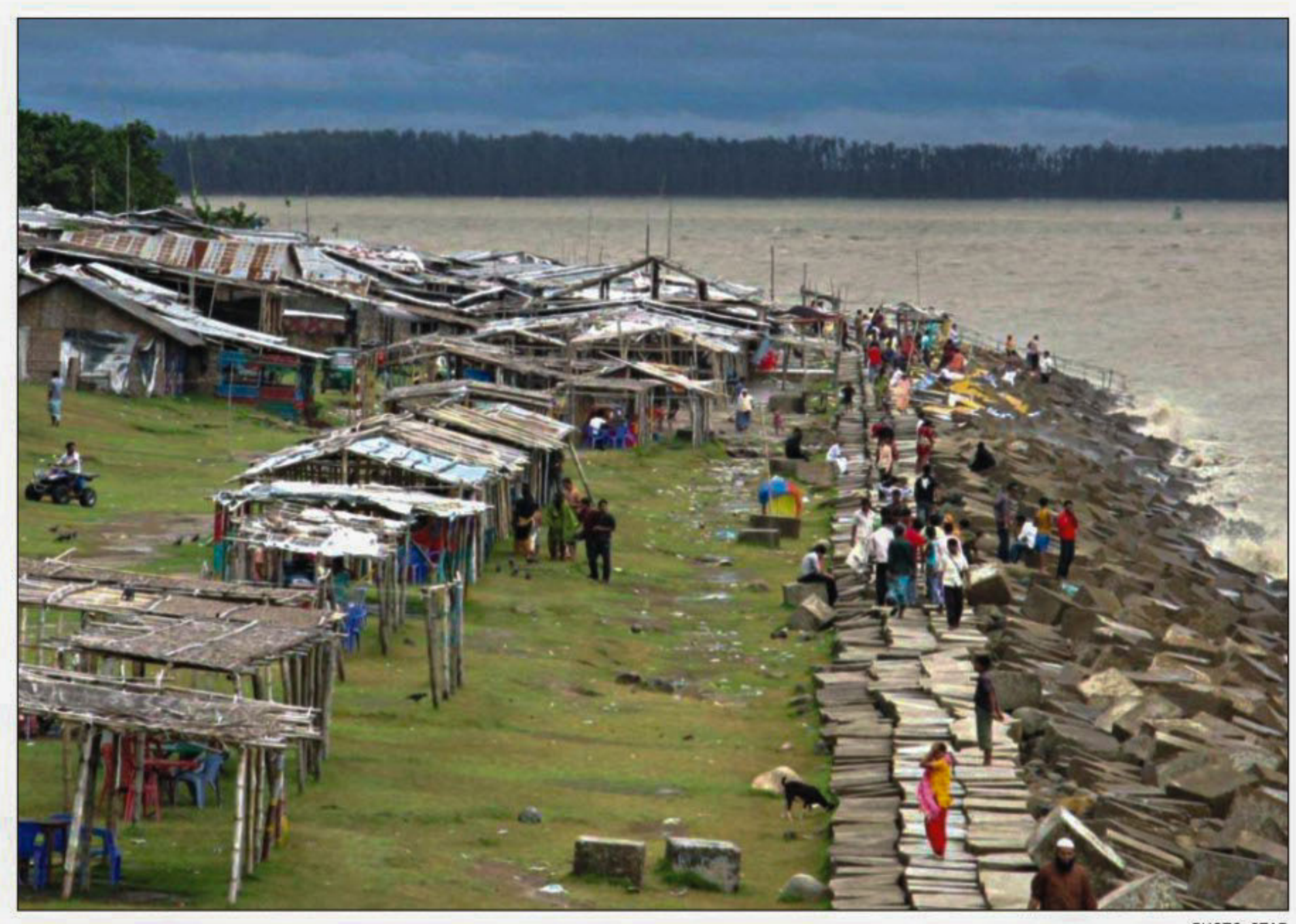
Nearly one kilometre stretch of the Patenga beach, highly valued by the dwellers of Chittagong city as a recreational spot, is now occupied by illegal shops.