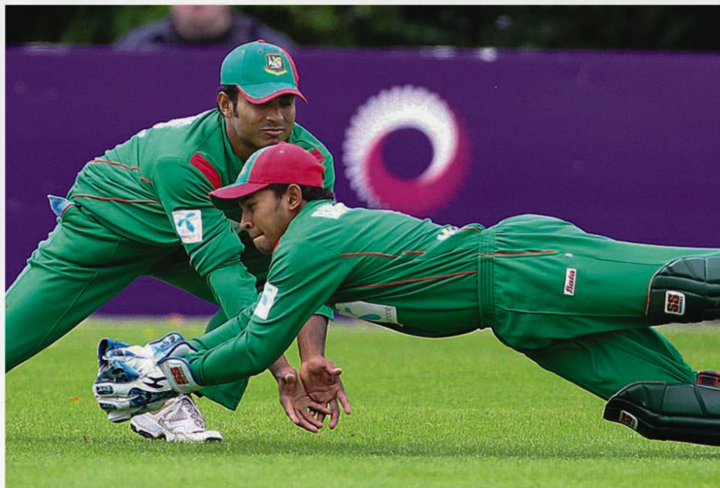
BACK IN THE SADDLE: Bangladesh wicketkeeper Mushfiqur Rahim (R) dives to his right to take the catch of Ireland opener Paul Stirling in the second one-day match at Stormont in Belfast yesterday. Mushfiqur returned to his duties behind the stumps after suffering a facial injury in the first one-dayer against England last week.