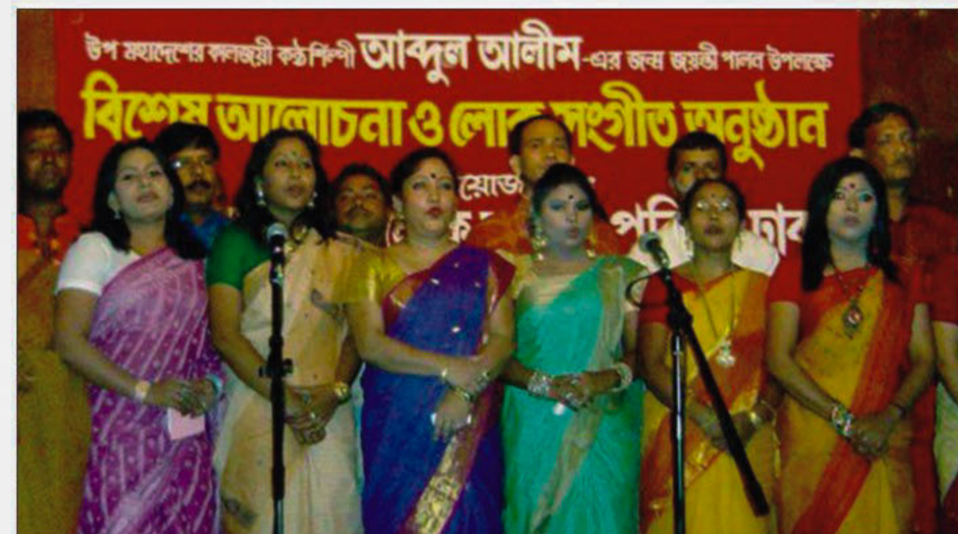
Members of Bangladesh Loko Sangeet Parishad render a song at a cultural programme held at the Poet Sufia Kamal Auditorium, National Museum, on July 14. Bangladesh Loko Sangeet Parishad arranged the programme to mark the birth anniversary of legendary folk singer Abdull Alim.