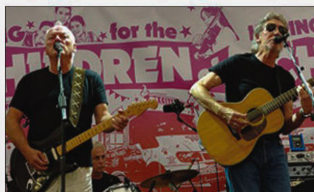
David Gilmour and Roger Waters on stage.

Even without Gilmour, Waters' The Wall tour is one of the few treks that has seemingly stayed off the summer's concert industry struggles: While artists including Rihanna and the Jonas Brothers