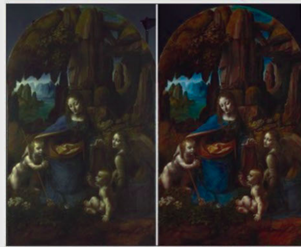
An image made available by the National Gallery in London of Leonardo da Vinci's "Virgin on the Rocks" before (left) and after restoration.

The restored painting showed a range of completion from the barely sketched hand of the angel to the fully realised heads of the main figures - consistent with many of Leonardo's works. The Italian