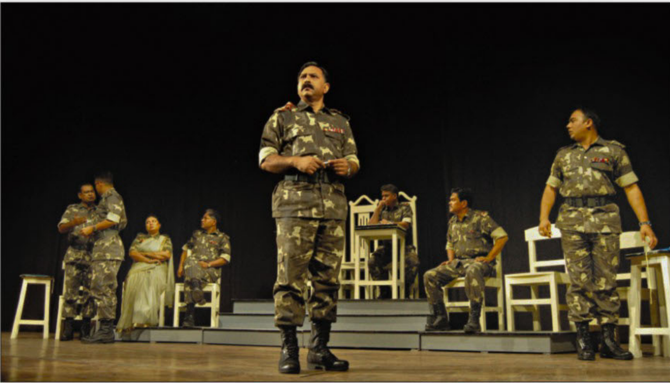
Actors of Theatre Art Unit in "Court Martial."