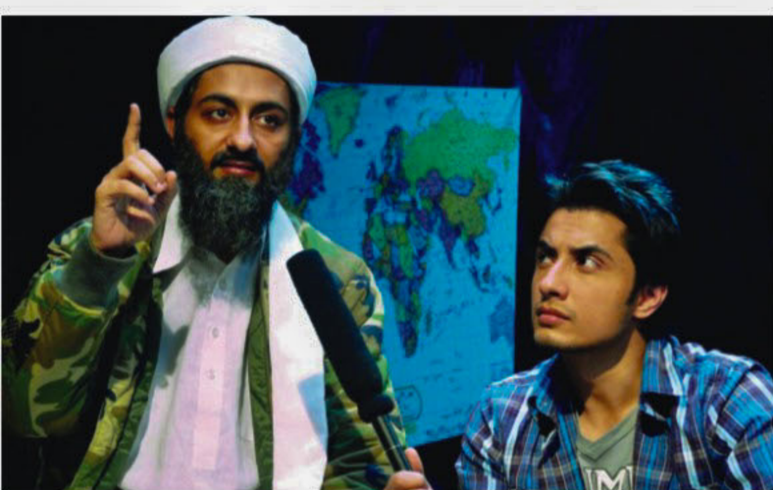
Ali Zafar (right) and co-actor in the film.

Pakistani singer-actor Ali Zafar on his debut film