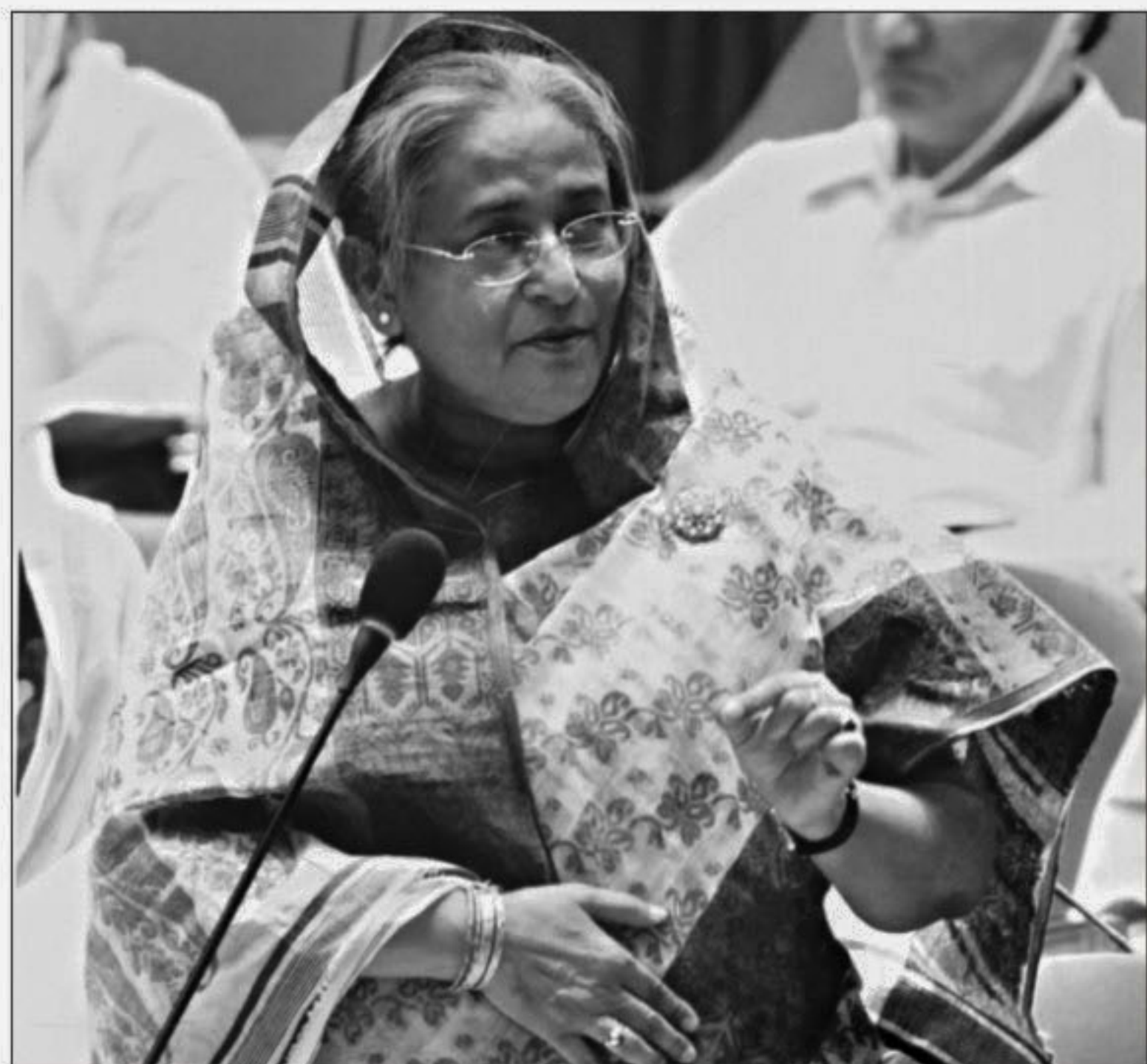
Prime Minister Sheikh Hasina speaks at the question-answer session in parliament during the PM's question hour yesterday.

She further informed that the government has taken measures to set up a domestic airport at Rampal of Bagerhat to aid Mongla Port and the tourist spots of the area. A project titled "Construction of Khanjahan Ali Airport (Rampal, Bagerhat)" will be implemented at a cost of Tk 470.30 crore. The airport will provide quick transport facility between the south and western districts.