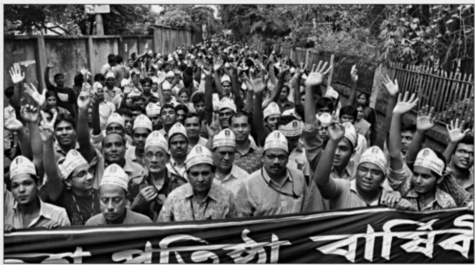
Teachers and students of Gono Bishwabidyalay (University) in Savar bring out a procession celebrating completion of its 12 years yesterday.