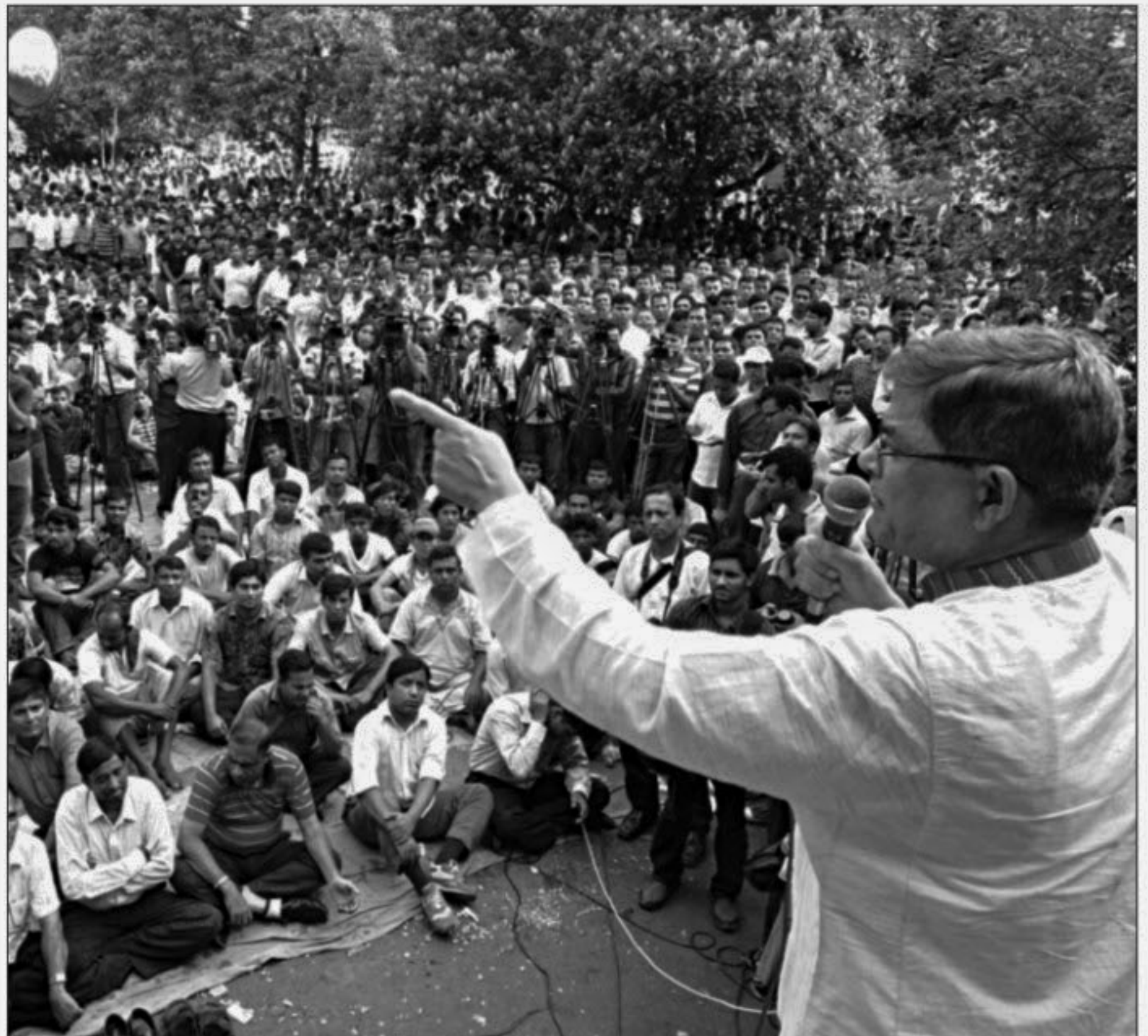
BNP Senior Joint Secretary General Mirza Fakhru Islam Alamgir speaks at a protest organised by BNP at Muktagong yesterday.