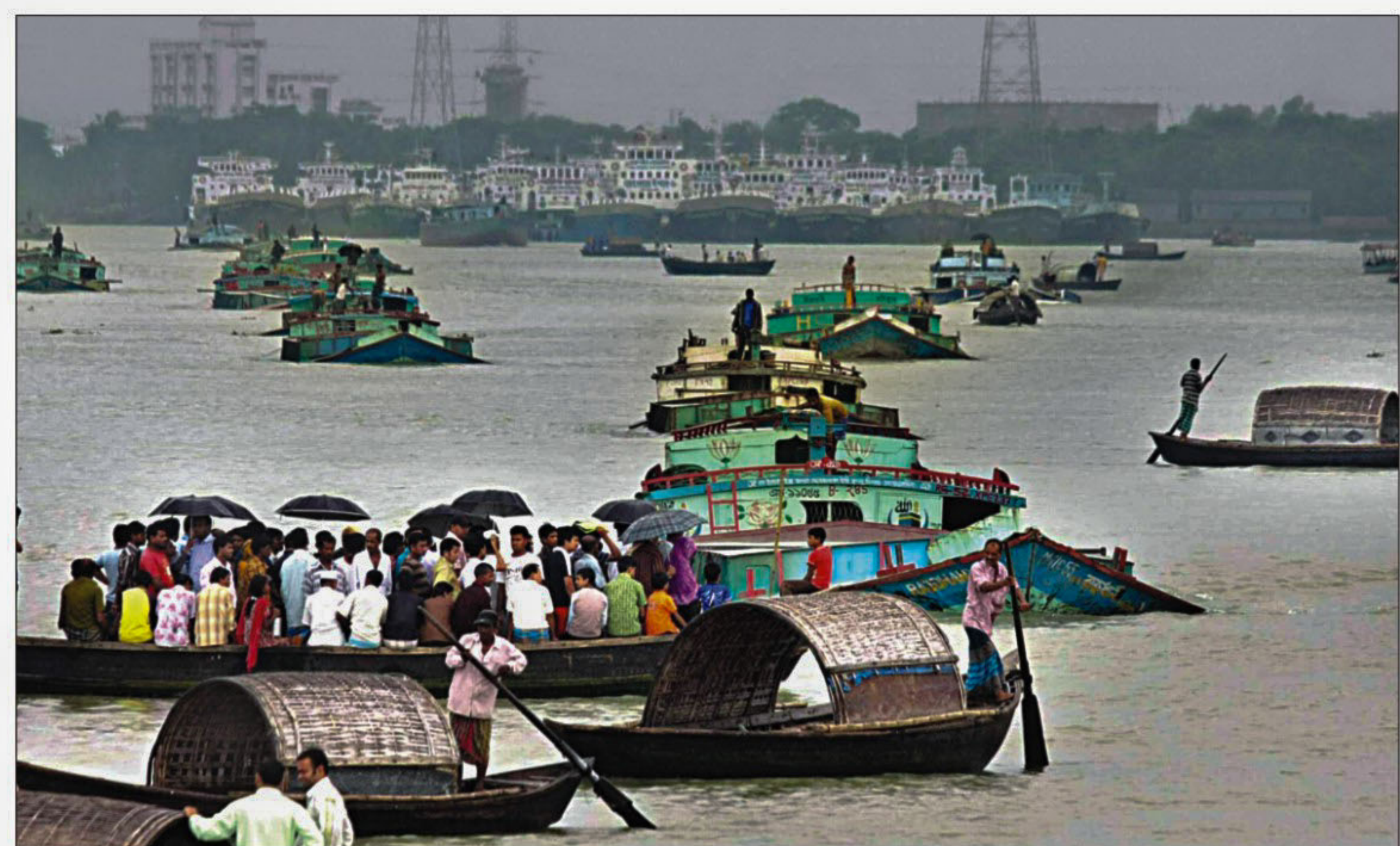
Cargo boats loaded with sand ply dangerously close to ferryboats crossing the Shitalakkhya at Tanbazar in Narayanganj. Only a few days ago eight people drowned when a sand-laden cargo boat hit such a ferryboat.

According to shipping department statistics, over 3,000 registered sand carriers ply different waterways across the country. A leader of Bangladesh Cargo Vessel Owners Association put the figure at 10,000 including the unregistered ones.