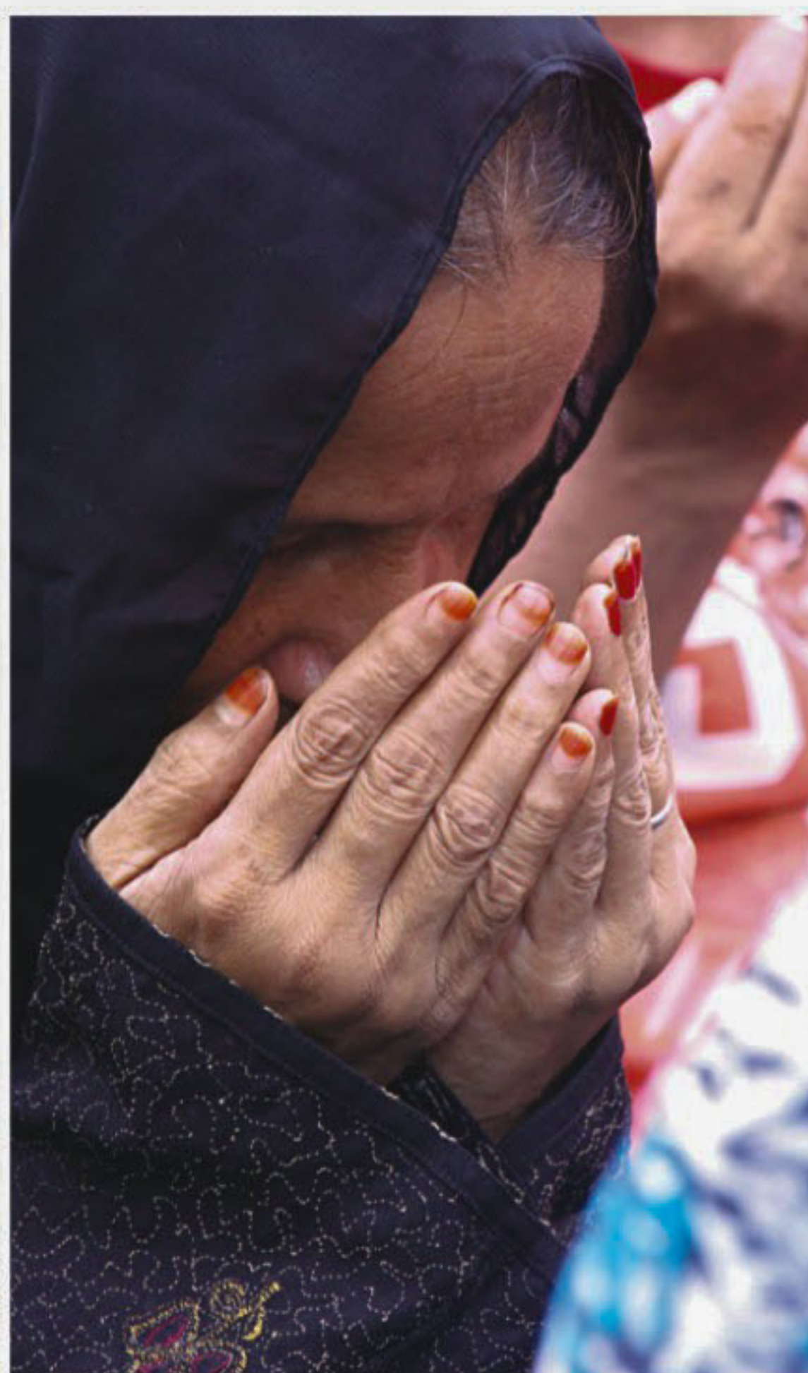
A woman prays yesterday for the departed souls of her family members died in the Nimtoli blaze during chehram, a religious programme observed 40 days after a person's death.

Only seven survivors are fighting with burn injuries at city's Combined Military Hospital while others have returned to their homes in the area after receiving