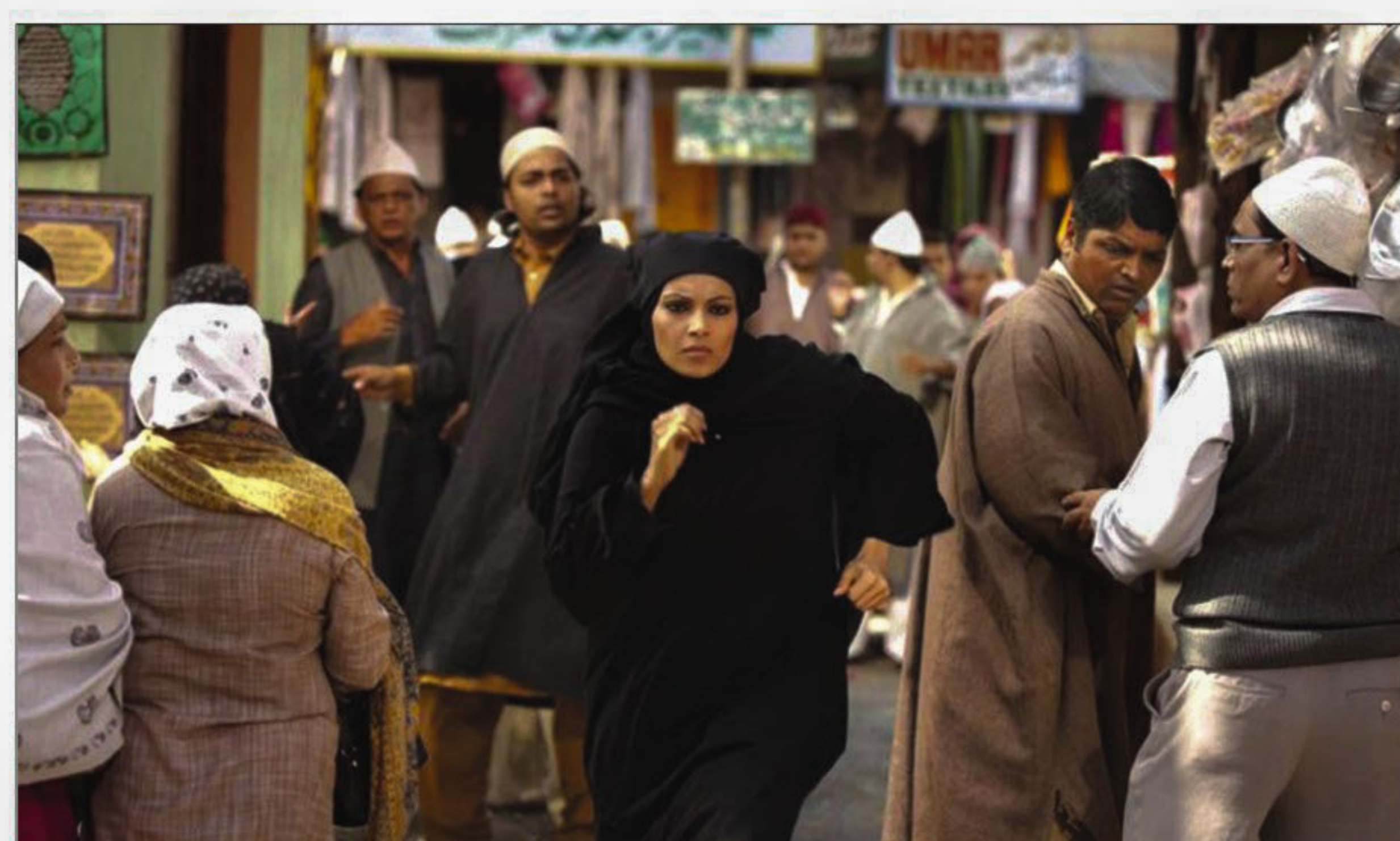
Bipasha Basu in a scene from "Lamhaa."