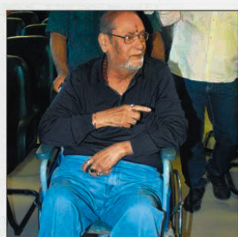
excited about the role."

However, as he flew to Delhi, the veteran actor said he "is nervous and