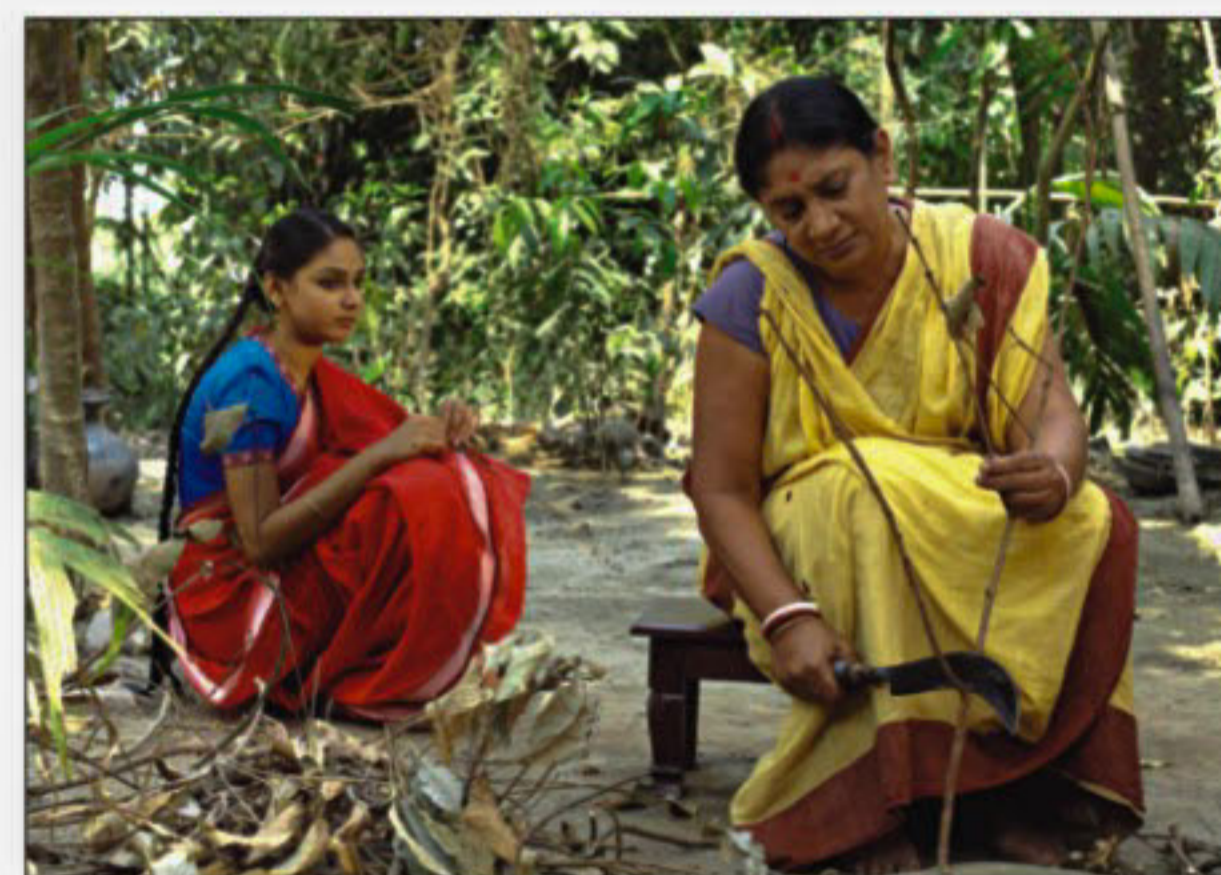
A scene from the serial.

better life for her offspring unfolds throughout the serial. The cast includes Ferdousi Majumdar, Humayun Faridee, Afroza Banu, and more.