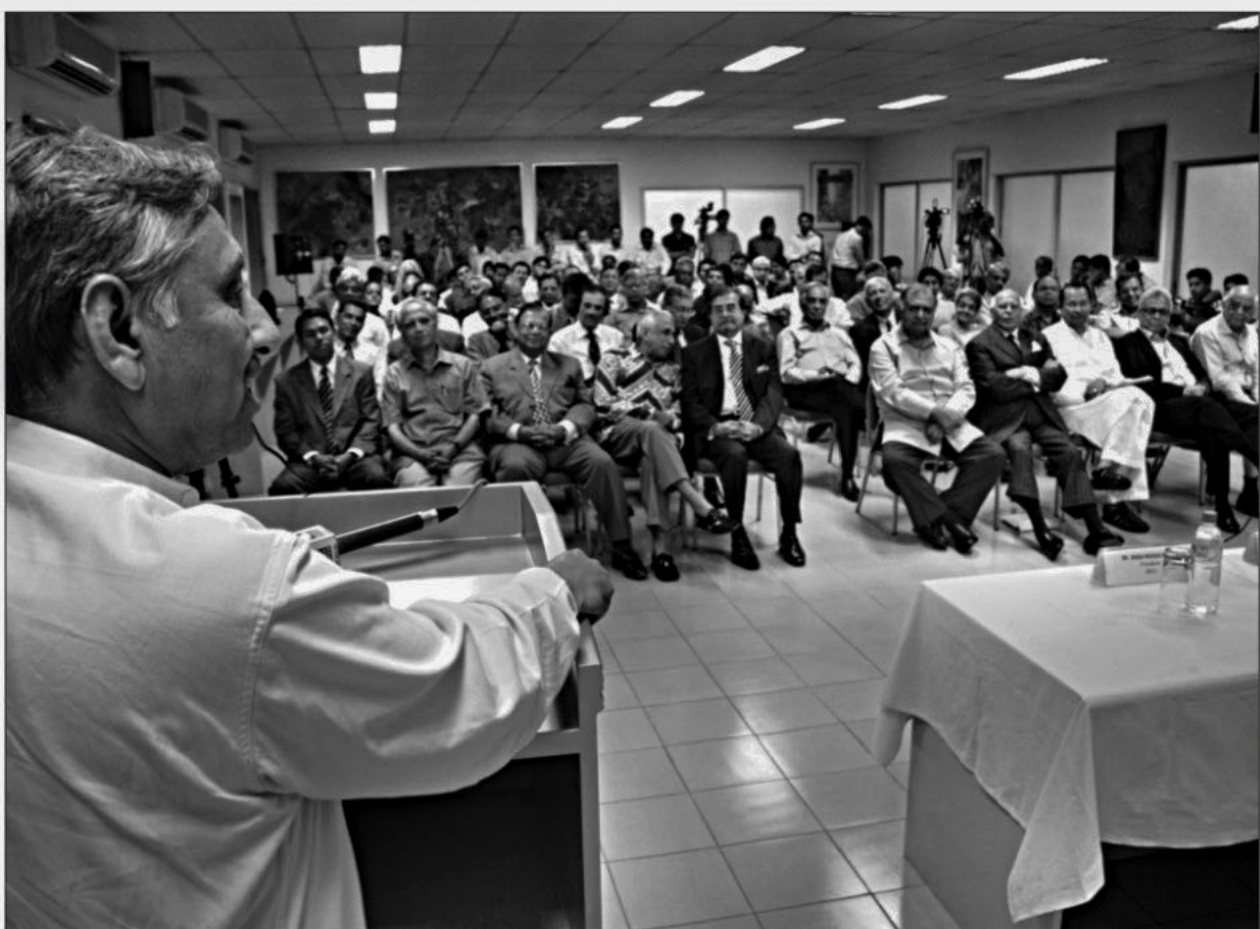
Mani Sankar Aiyar speaks at a discussion on "Bangladesh-India relations" at Bangladesh Enterprise Institute conference room in the city yesterday.