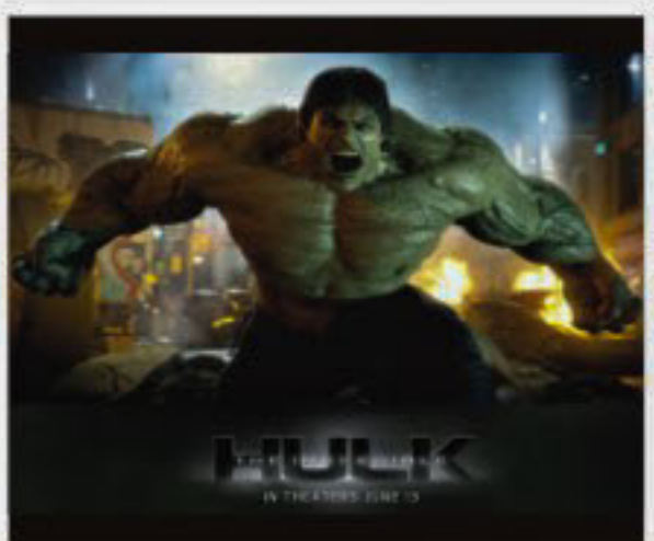
The Incredible Hulk On HBO at 11:00pm Genre: Action Cast: Edward Norton, Tim Roth