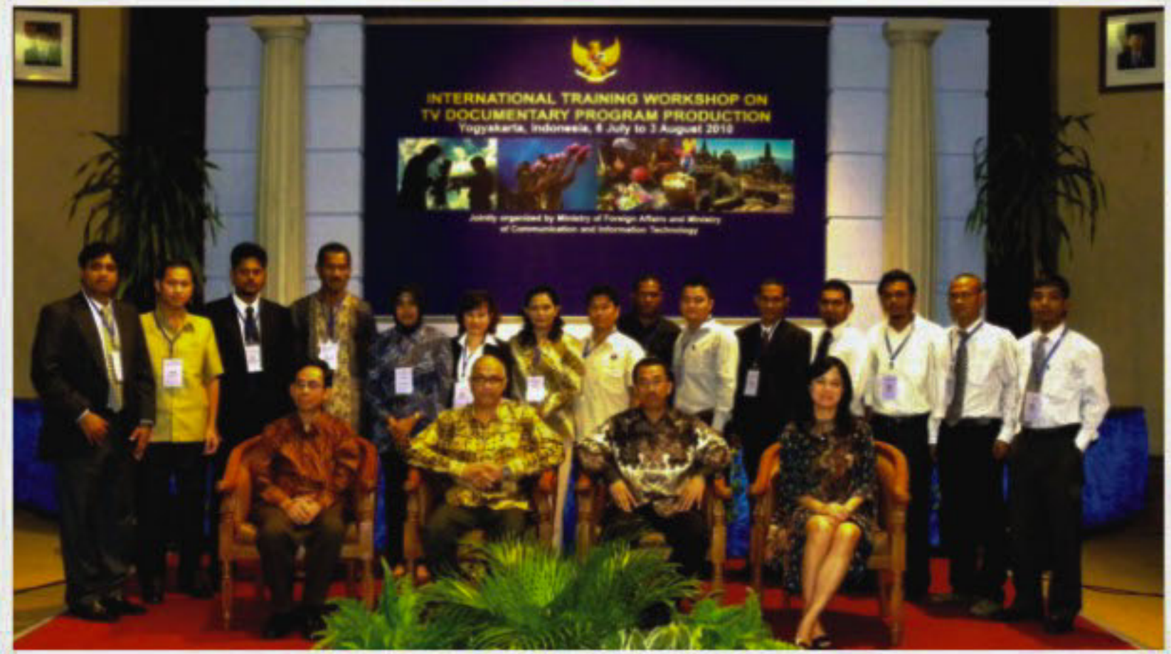
Participants (back row) with organisers of the training workshop.

Ministry of Foreign Affairs of Indonesia is organising the workshop in cooperation with Ministry of Communication and Information Technology. Some fourteen participants from eight developing countries -- Bangladesh, Lao PDR, Maldives, New Caledonia, Papua New Guinea, Sri Lanka, Timor Leste and Vietnam, as well as two participants from Indonesia are taking part in the training, which will