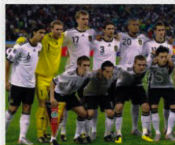
FIFA World Cup Football On ESPN at 12:20am Match: Uruguay vs. Germany Live from Nelson Mandela Bay Stadium, Port Elizabeth

9:00 am, 2:00 pm, 9:00 pm, 10:30 pm, 12:30 am ATN BANGLA NEWS (Bangla): 7:00 pm, 10:00 pm, 11:00 pm, 1:00 am, 4:00 am News (English) at 6:00pm Rtv News (Bangla): 2:30 pm, 4:30 pm, 6:30 pm, 8:30 pm, 10:30 pm, 12:30 am ntv News (Bangla): 7:30am, 12:02pm, 2:00pm,