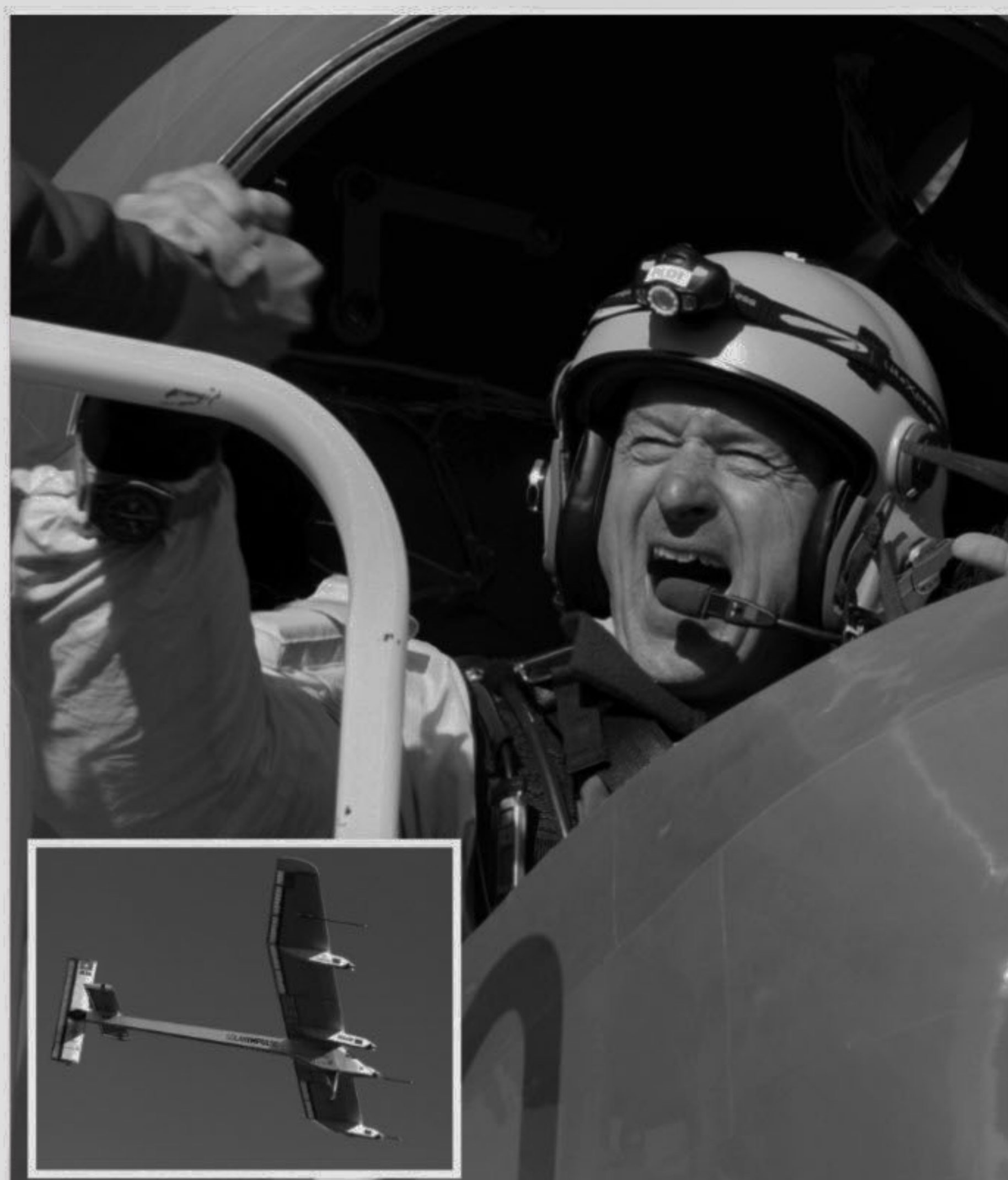
Swiss solar Impulse's pilot Andre Borschberg flies in the solar-powered HB-SIA prototype airplane (in the inset) during its first successful night flight attempt at Payerne airport yesterday. The aircraft took off July 7 at 06:51 am and reached an altitude of 8,700 meters (28,543 feet) by the end of the day and completed 26 hours of flight time.

The Shia majority in Iraq have been a main target of Sunni Arab armed groups since the US-led invasion of 2003 toppled now executed dictator Saddam Hussein's Sunni-dominated regime.