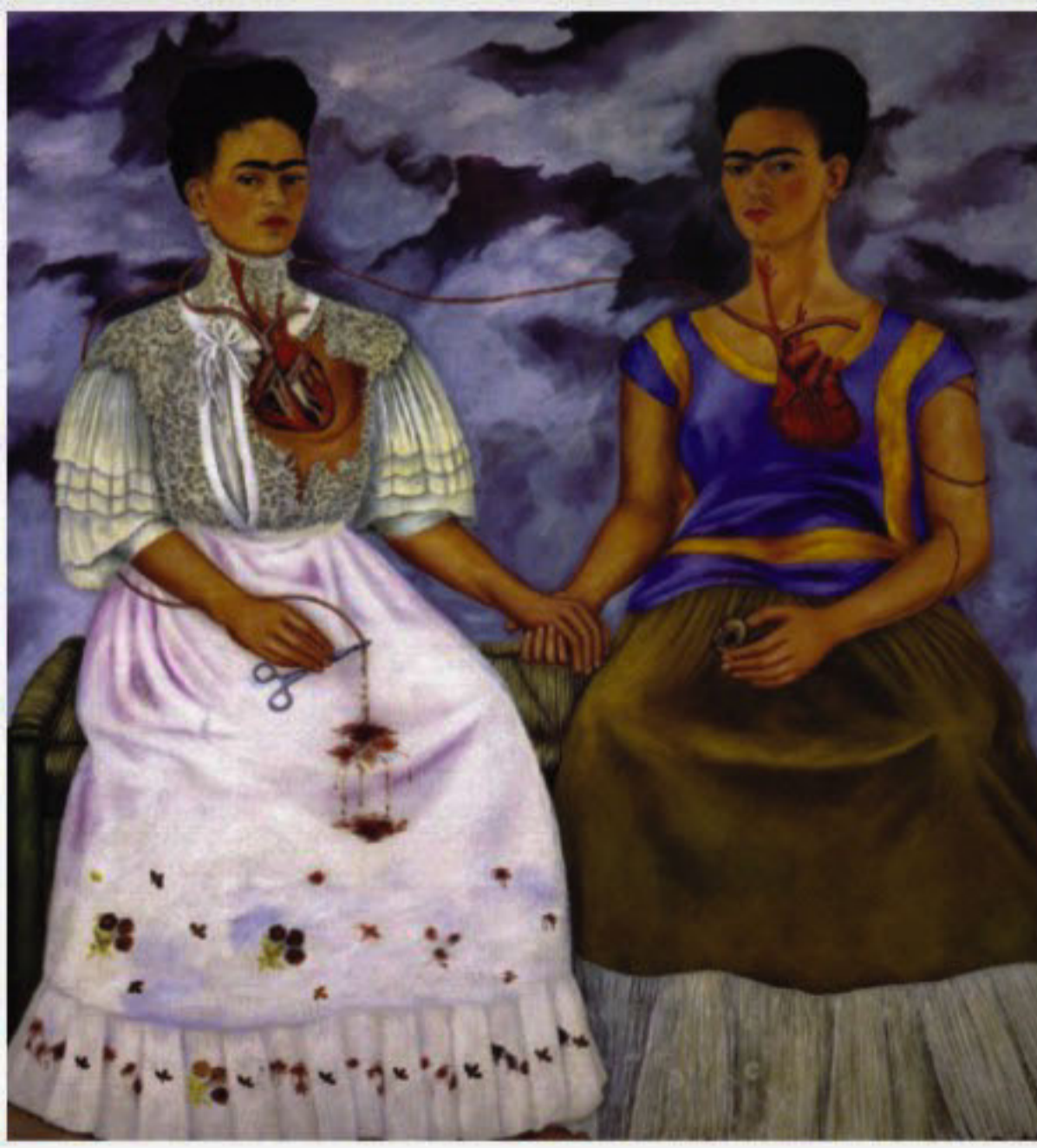
Most of her paintings were self-portraits that expressed pain that she experienced both physically and mentally

Frida Kahlo's 103rd birthday celebrated with Google doodle