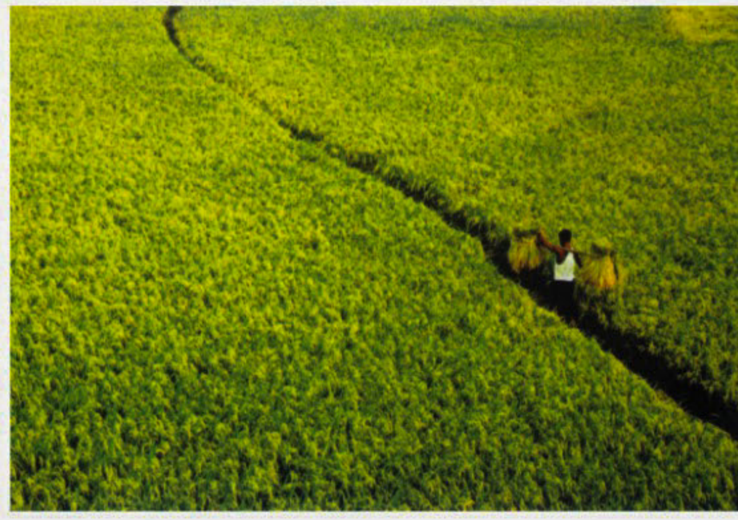
Clockwise (from top-left):