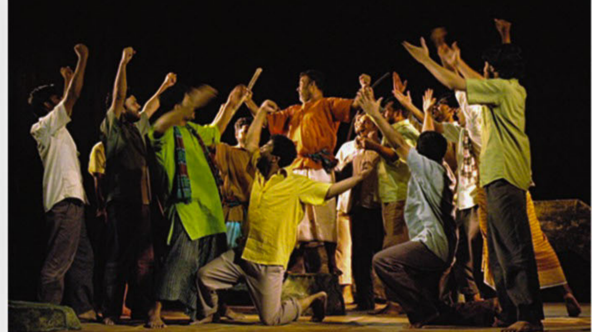
Theatre Art Unit will stage "Shomoyer Proyojoney" on the opening day of the festival.