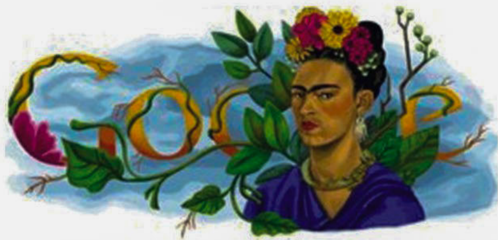
The Google doodle on July 6, 2010, in honour of Frida Kahlo.