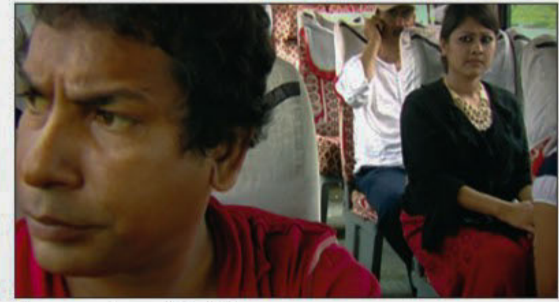
A scene from "FnF"