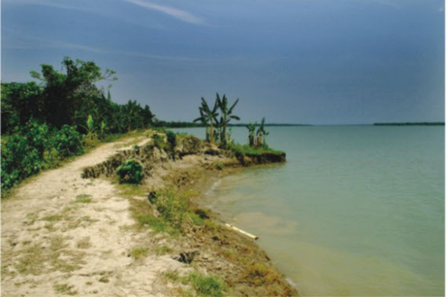
Scenes (top and bottom-left) from the documentary.