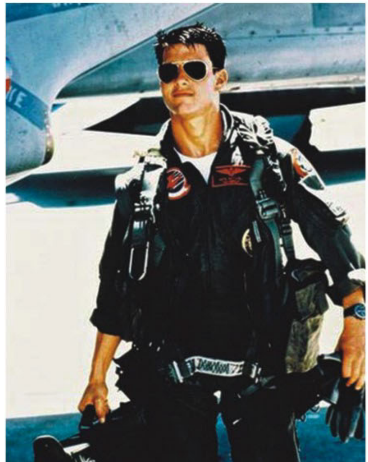
Tom Cruise in "Top Gun."

Tom Cruise could reprise his role of Maverick from his 1986 classic "Top Gun."