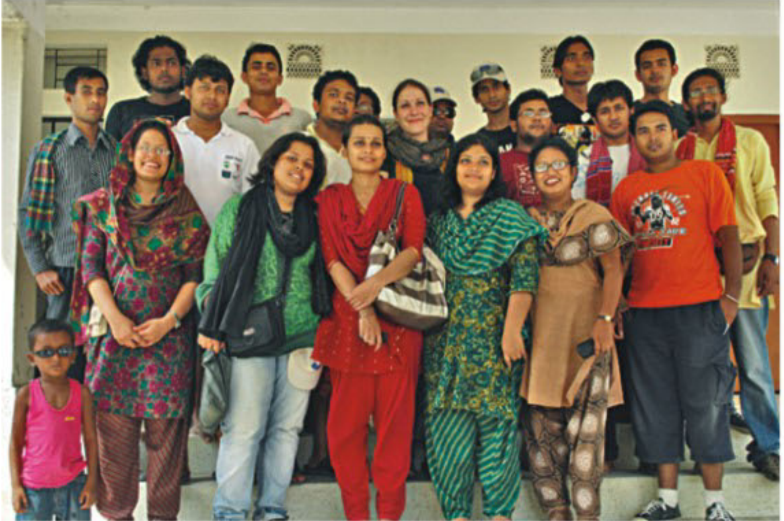
ULAB students who made the film.