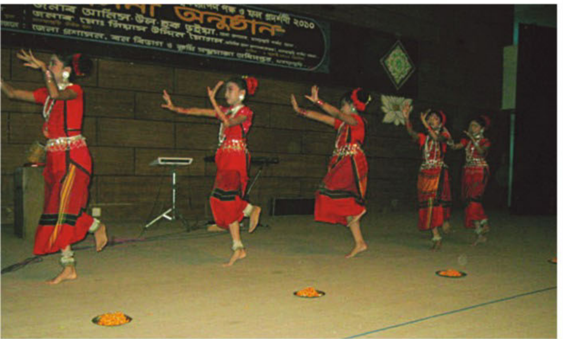
A dance performance by young artistes.

This initiative has its roots in the successful performance by different government and non-government organisations (NGOs) in the participatory afforestation programme in the district over the last five years.