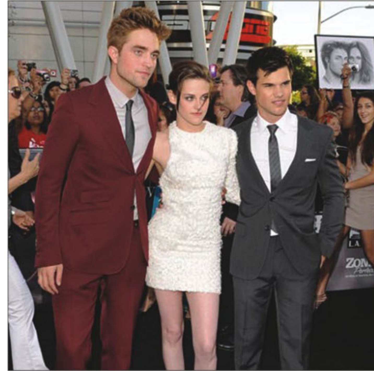
(From left) Robert Pattinson, Kristen Stewart and Taylor Lautner.