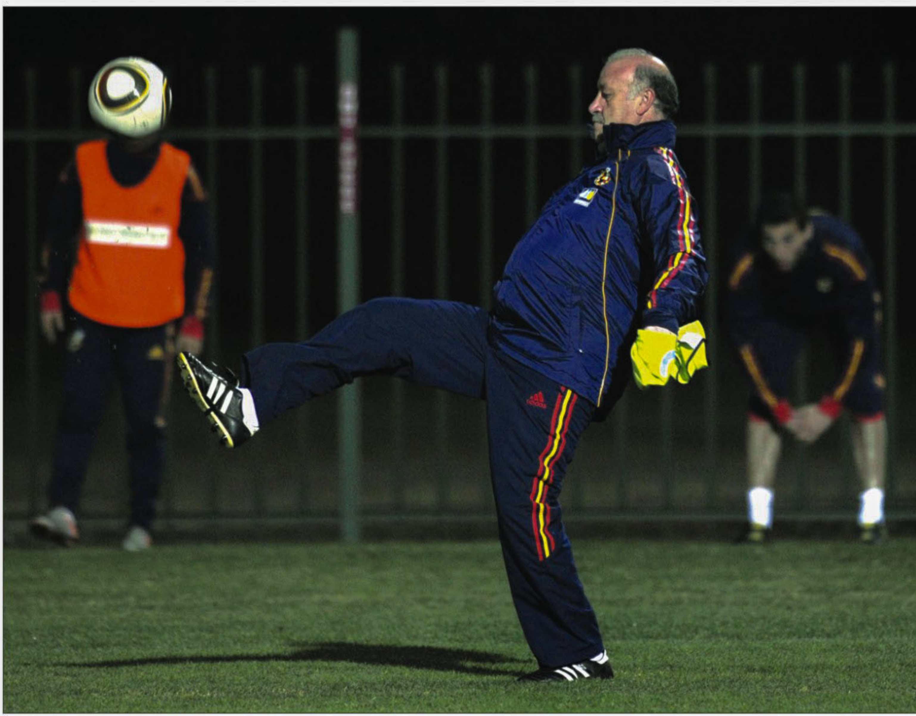
Spain coach Vicente Del Bosque plays with the ball during a training session at the North West University Sports Village in Potchefstroom on Sunday.