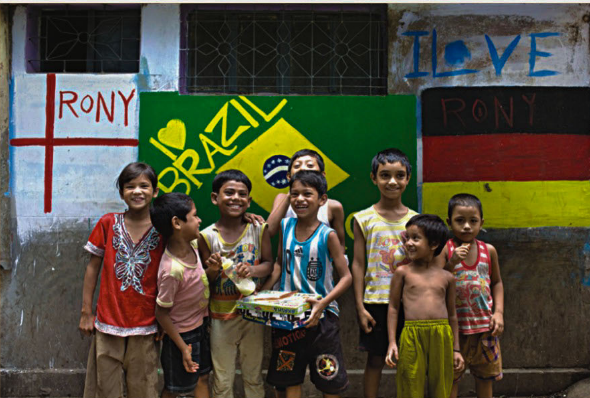
Off Nazimudin Road.