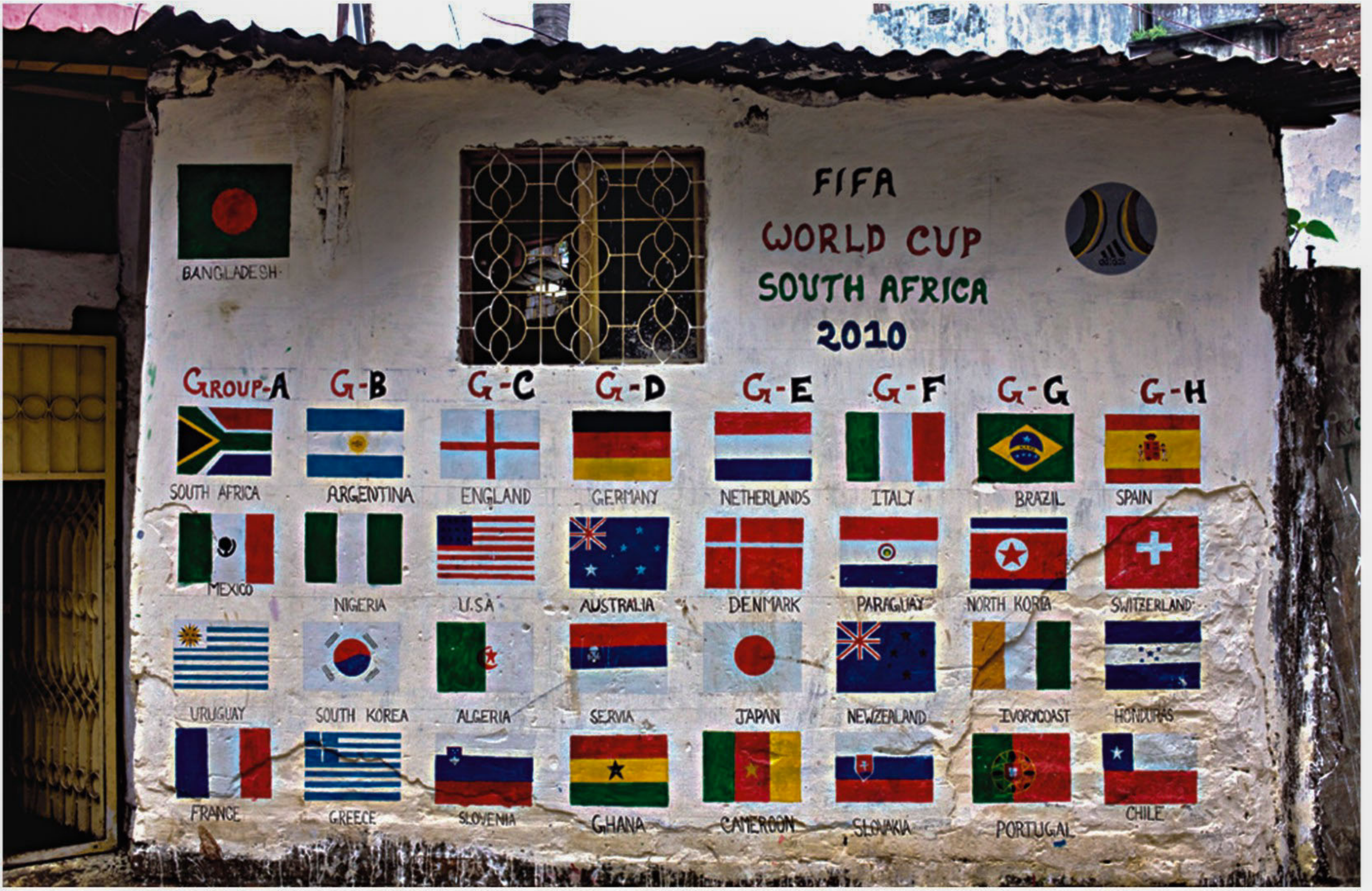
Taher Bagh Lane.