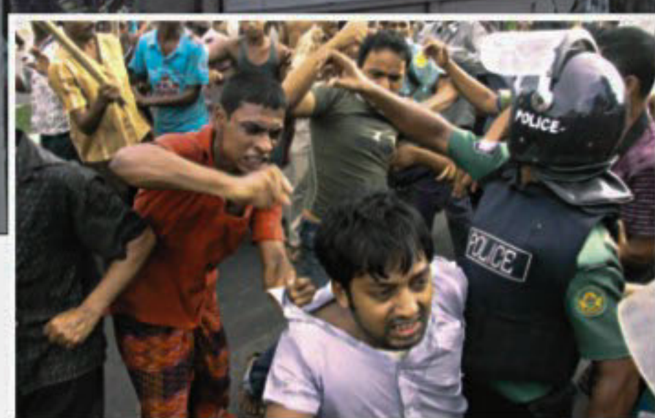
Clockwise from left, Locals beat a Shibir activist at Halishahar in the port city yesterday after Jamaat-Shibir men vandalised shops and vehicles in the area. A police booth damaged and car vandalised in Chittagong yesterday during an angry demonstration by Jamaat-Shibir activists demanding the immediate release of arrested Jamaat trio.