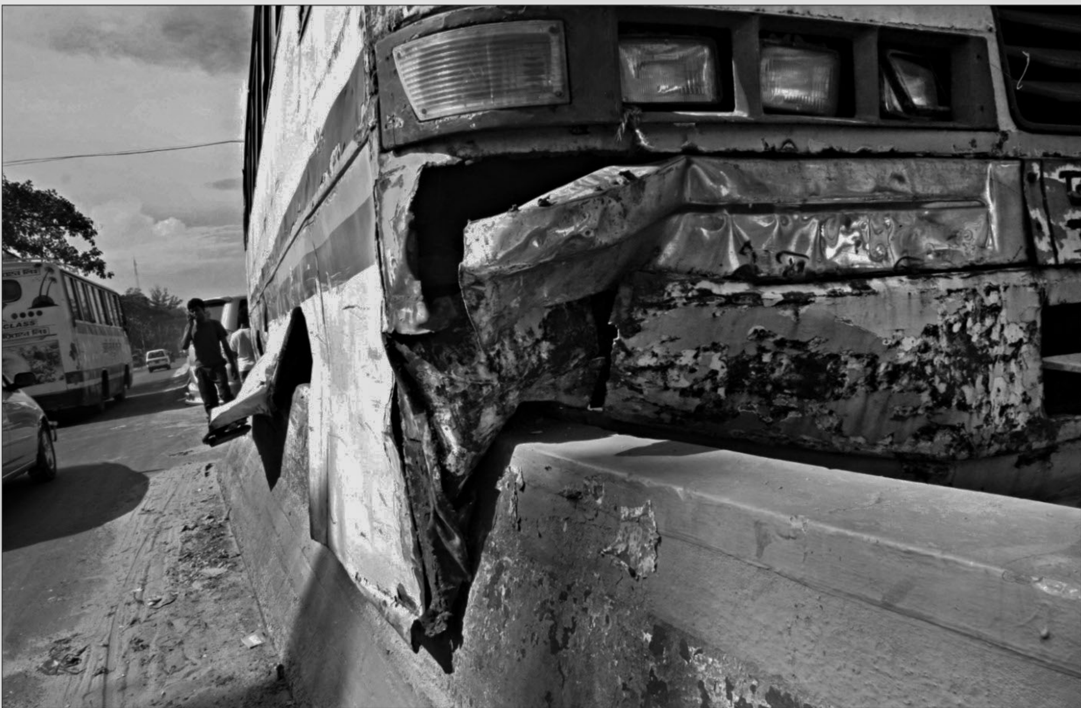
RECKLESS DRIVING: A passenger bus crashes into a road divider on Dhaka-Gazipur Highway at Tongi as its driver lost his control over the steering due to rash driving yesterday. Road accidents caused by careless driving are common in the country as drivers disregard traffic rules and the members of the law enforcement agencies are indifferent to the problem.