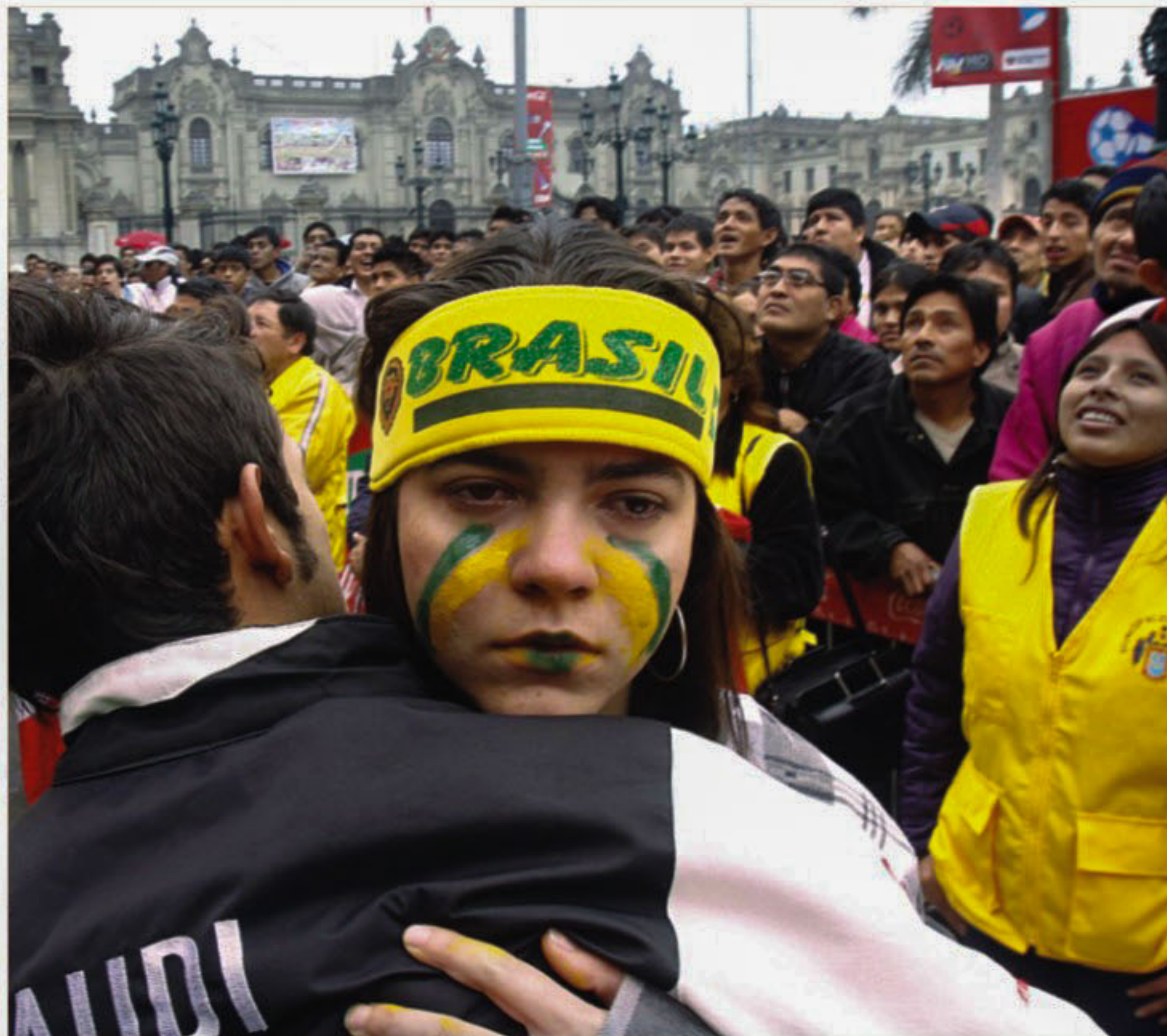
FOR EVERY ROAR THERE'S A TEAR: Dutch fans (L) celebrate their side's 2-1 win over Brazil in central Rotterdam on Friday as (R) a resident of Lima in Peru cries for her beloved Selecao at the same time.