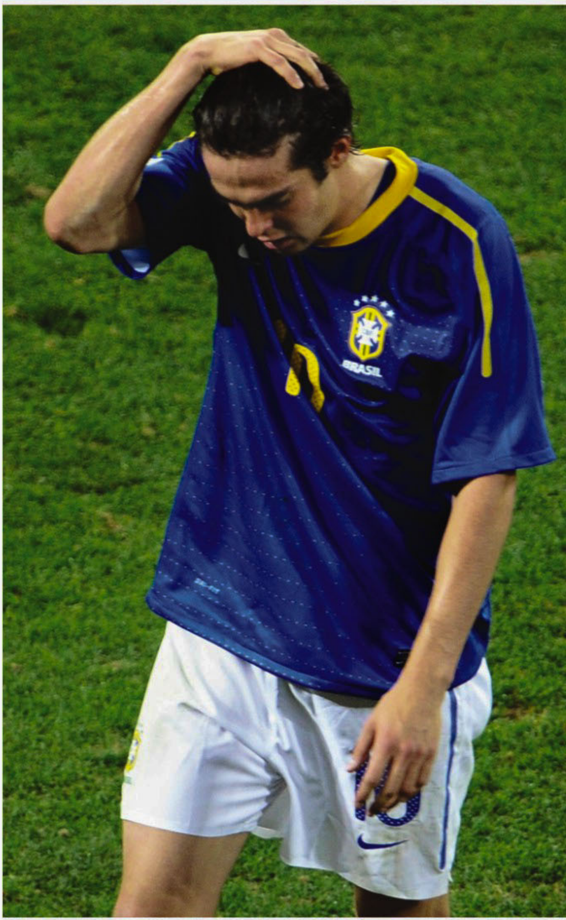
IT IS OVER: A miserable Kaka walks off after their shock defeat at the hands of the Dutch during the quarterfinal at the Nelson Mandela Bay stadium in Port Elizabeth on Friday.