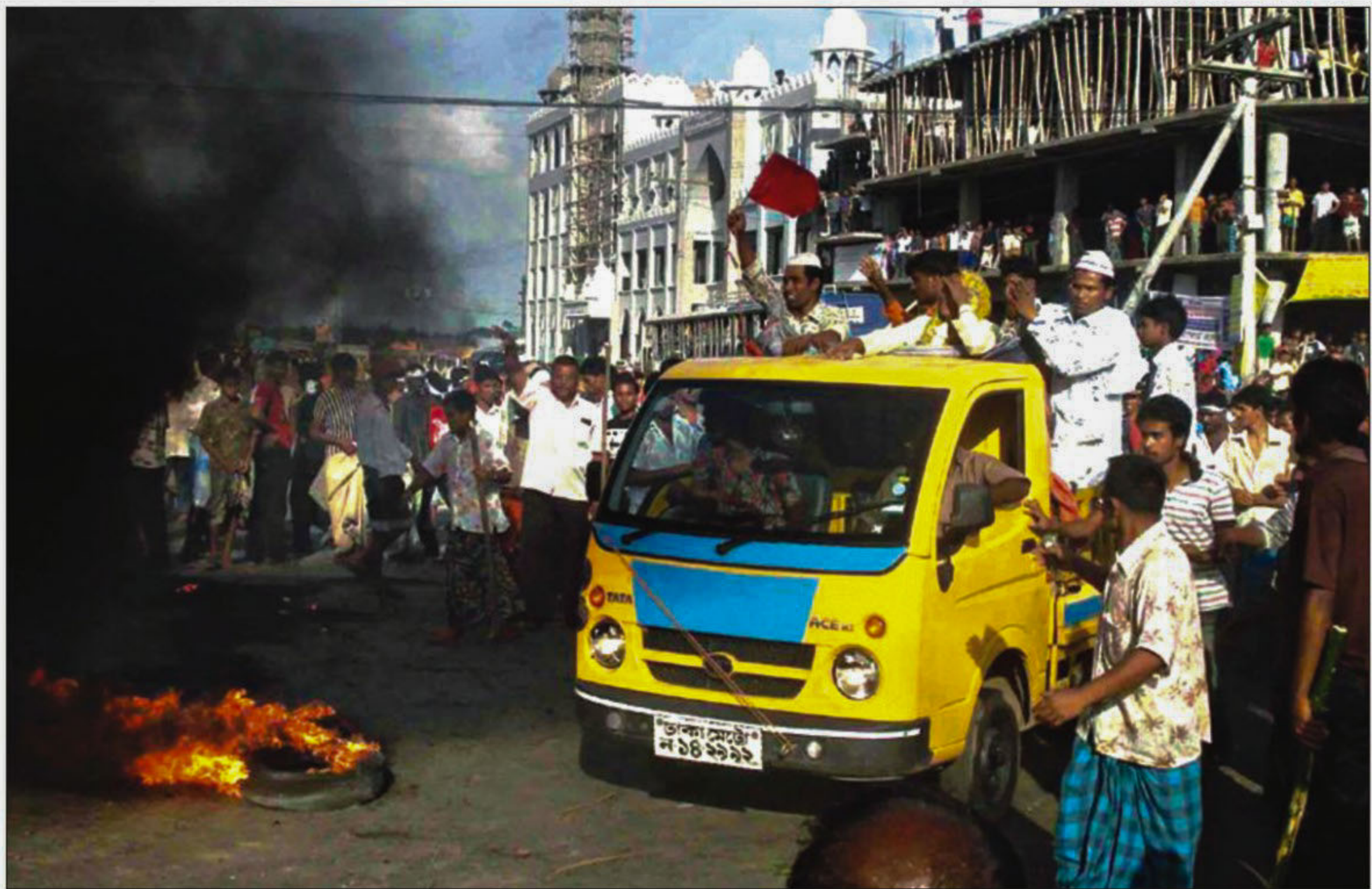
Agitators put barricade on Dhaka-Mymensingh road yesterday protesting against the Rajuk's satellite town project in Gazipur. The mob brought out processions and set fire to a factory. The project has been cancelled following the prime minister's intervention. Story on page 1.