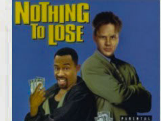
Nothing To Lose On Star Movies at 09:30pm Cast: Martin Lawrence, Tim Robbins