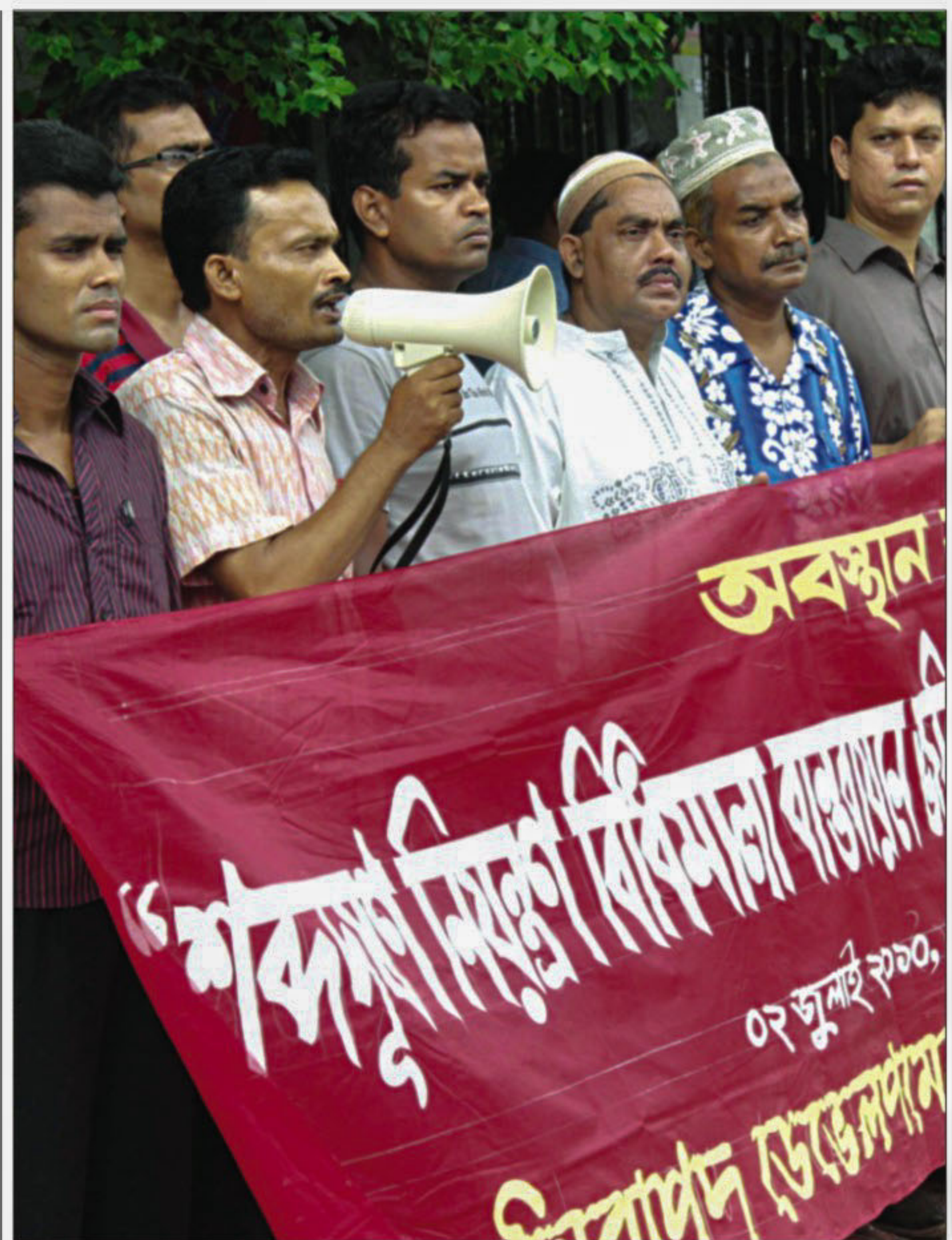
Nirapad Development Foundation stages a demonstration in front of the National Press Club in the city yesterday demanding enforcement of noise pollution control rules. (Story on Page 2)

The home minister distributed rice and cash among the cyclone victims. Each of the affected family got 20kgs of rice and Tk 2,000 in cash under the TR Project.