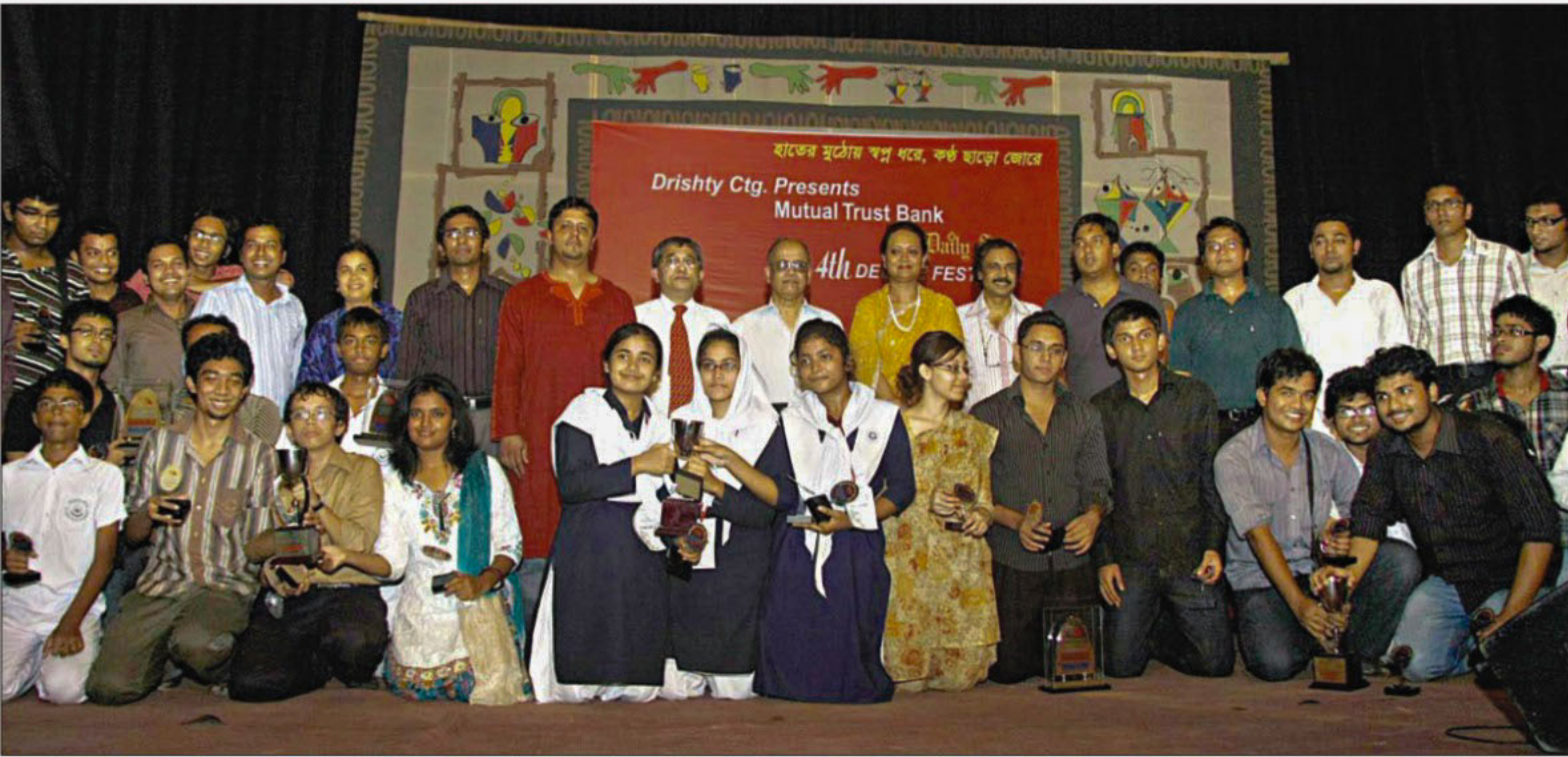
Winners of the 'Mutual Trust Bank-The Daily Star Debate Contest 2010' pose for photograph with the guests at the concluding ceremony of the two-day long debate competition at Chittagong Shilpakala Academy in the port city yesterday.