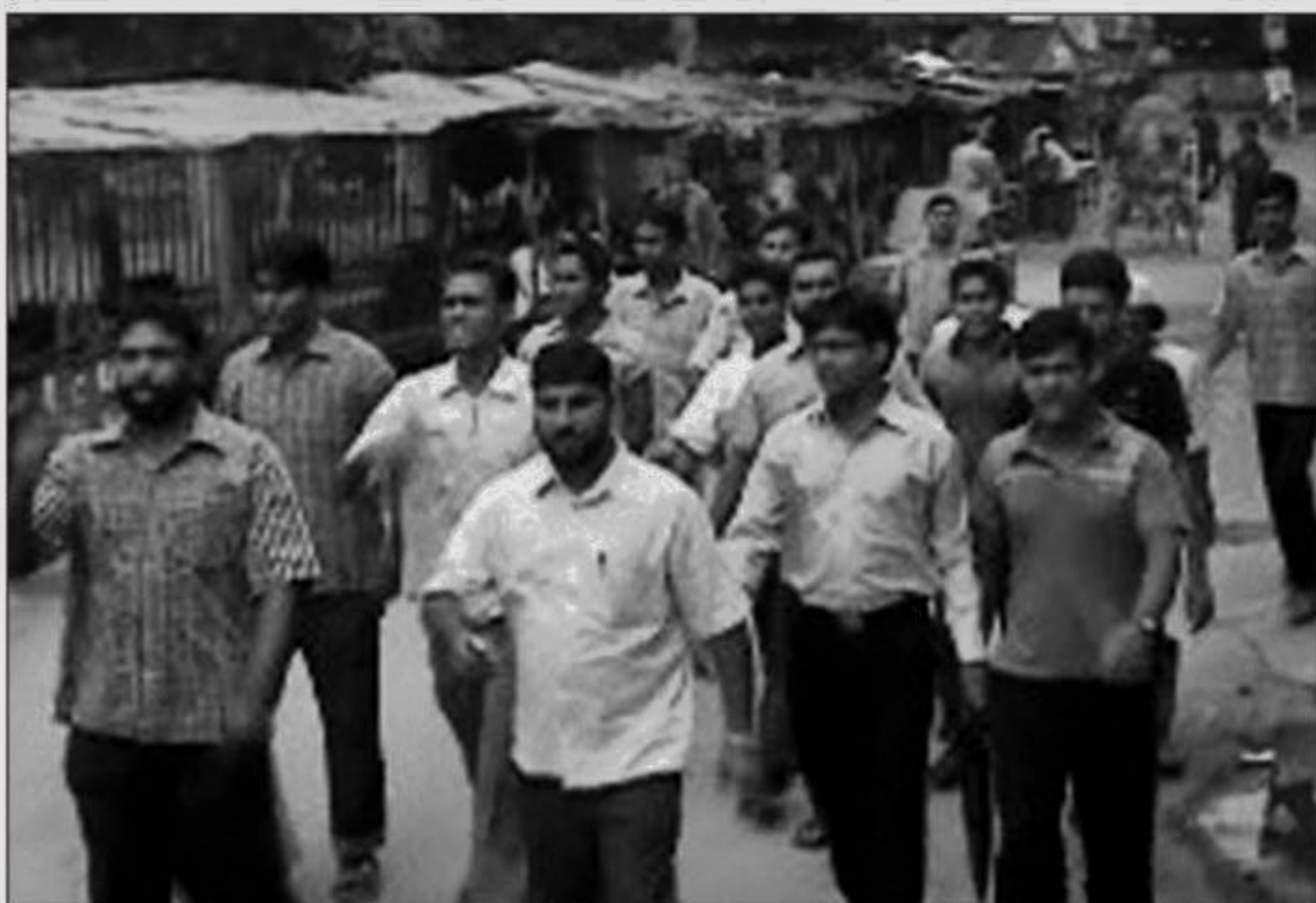
A few activists of Jamaat-e-Islami bring out a procession in Club Super Market area of Chapainawabganj town yesterday demanding release of three top leaders of the party.

The investigation officer said most of the top-ranking Jamaat leaders are on the run to avoid detention. Police is on the hunt to capture the accused.