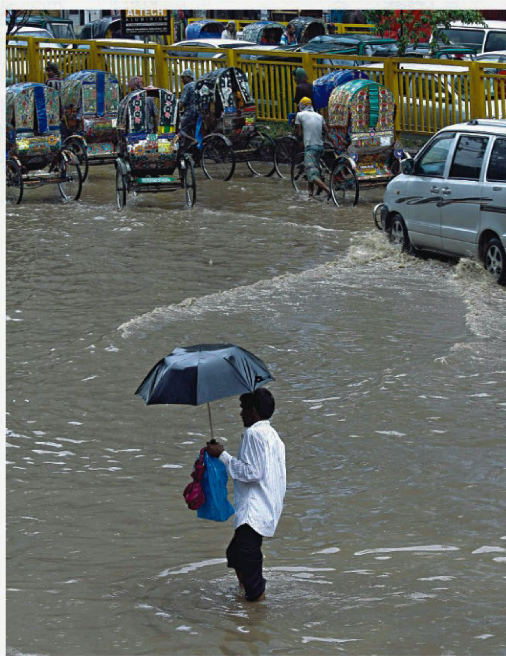
A man wades through knee-deep water at Mouchak intersection in the capital yesterday noon. The area gets waterlogged even after a couple of hours' downpour.