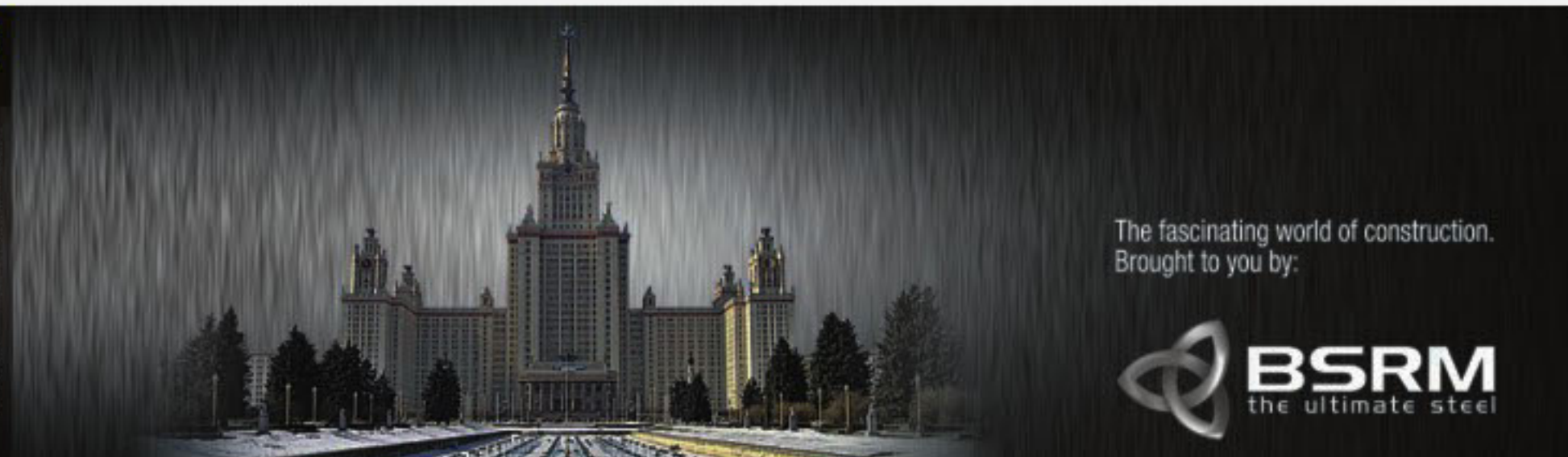
The fascinating world of construction. Brought to you by:

The main tower of Moscow State University, Russia, was the tallest building in Europe from its completion in 1953 until 1990. It consumed over 40,000 metric tons of steel, and at 240m is still the tallest educational building in the world.