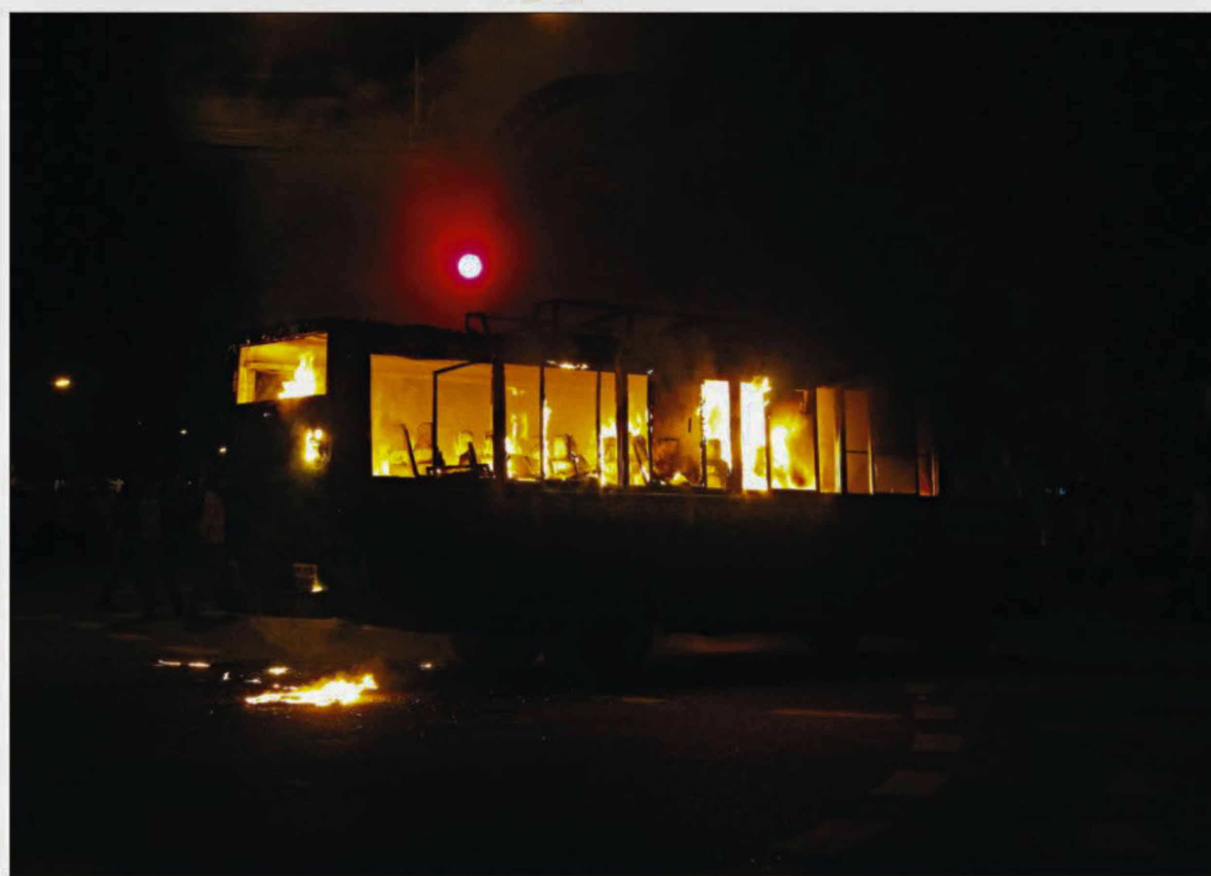
A bus ablaze in front of Dhaka College in the capital last night.