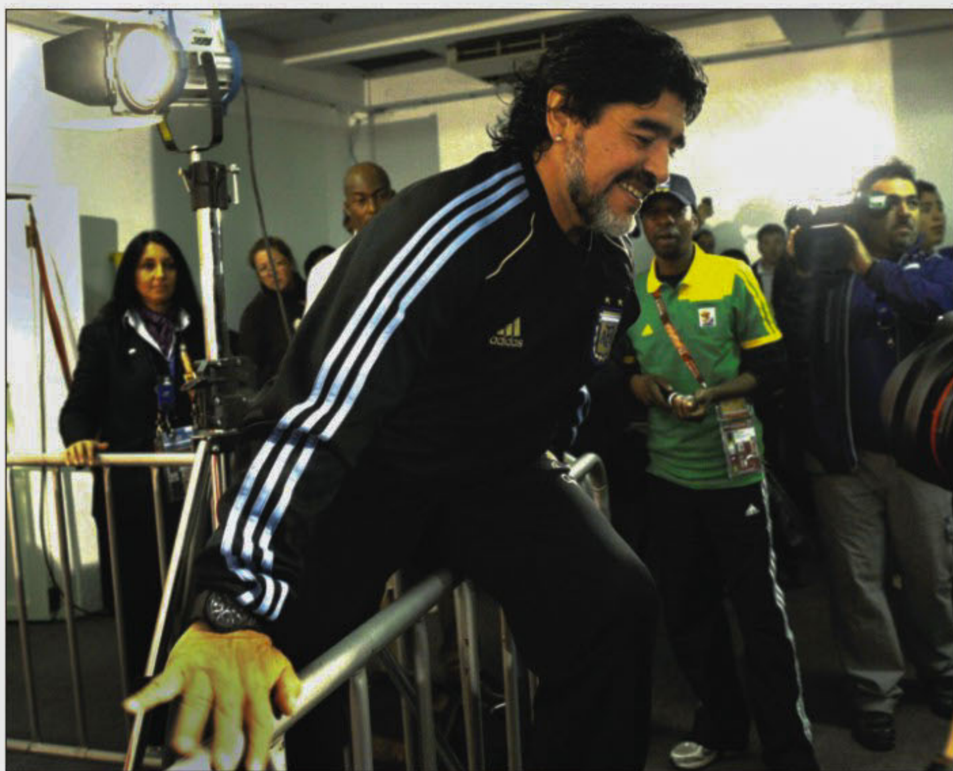
WHERE'S HE GOING? Argentina coach Diego Maradona jumps over a barrier to embrace former Napoli teammate Salvatore Bagni during a press conference at the Loftus Versfeld Stadium in Pretoria yesterday.

"I know him (Messi) pretty well - he is tough to play against and to stop. We have to