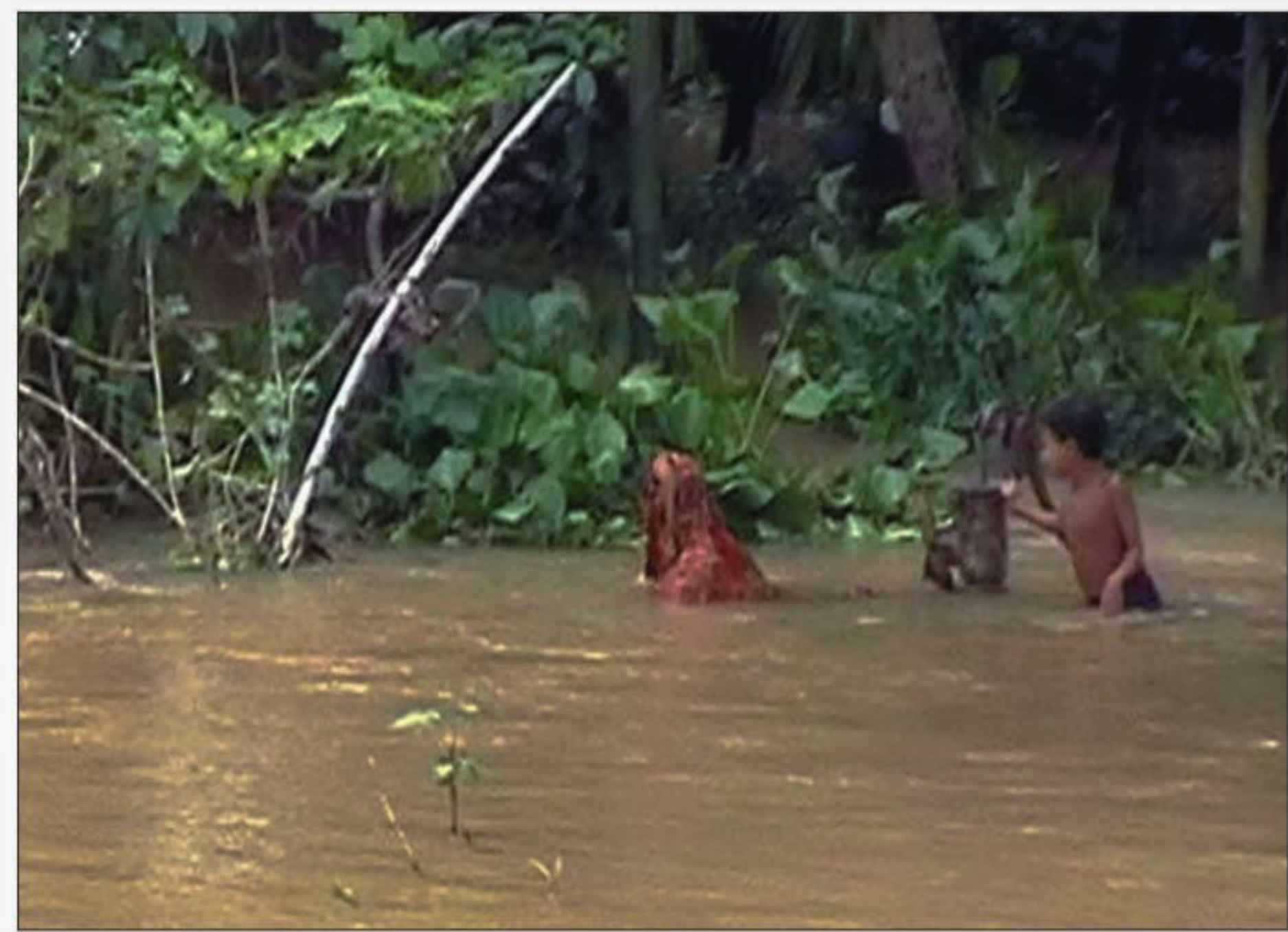
A boy tries to collect water from a nearly submerged tube-well at a village in Gaukandia union of Durgapur upazila where Netrakona district as rain-fed Someshwari River continues flooding large areas of the district.

Kalmakanda upazila administration sources said, erosion by a river Mohishkhola took a serious turn devouring over 100 dwelling houses at Bharapara, Hajongpara, Sannashipara and Panggaw villages in Kalmakanda upazila in the last two days.