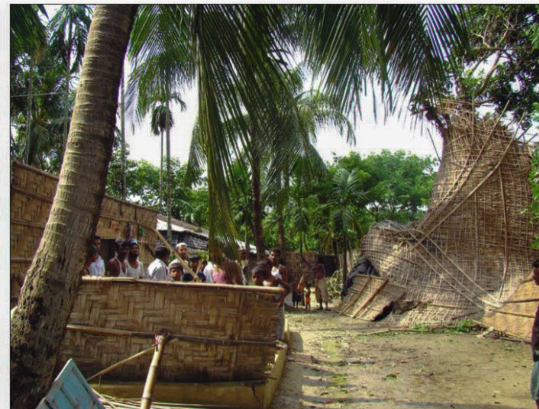
Homestead and betel leaf garden lie ravaged as tornado lashed areas at Dailpara in Teknaf upazila of Cox's Bazar district yesterday.

The station now conducts research on variety development and protection of different plants, their cultural management and post-harvest management, said RHRS officials.