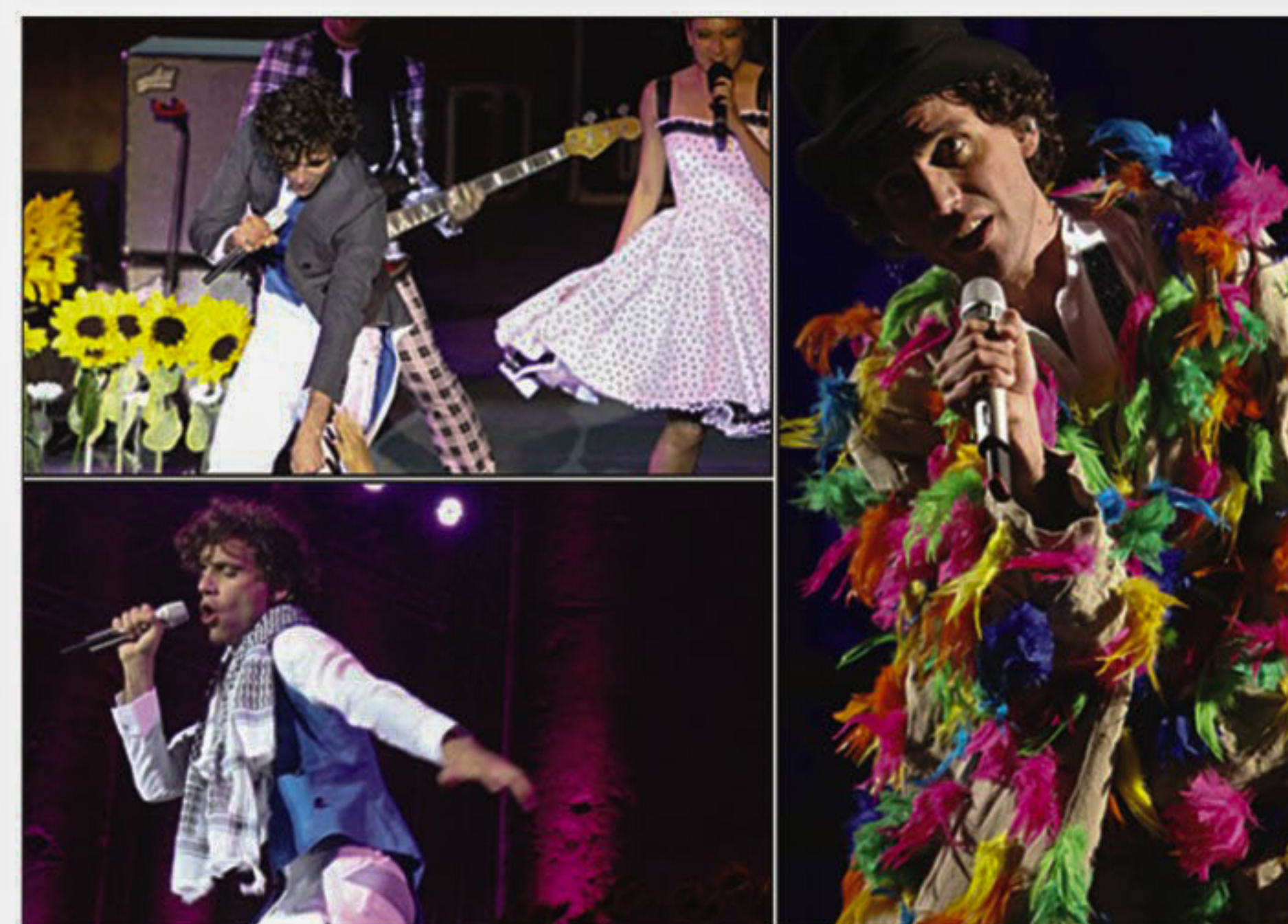
Pop star Mika performs at the opening of the Baalbeck International Festival in the Beqaa Valley of Lebanon. The annual event hosts dance, theatre, opera, and jazz as well as modern world music in the ancient Roman Acropolis, one of the largest and well-preserved Roman temples ever built.