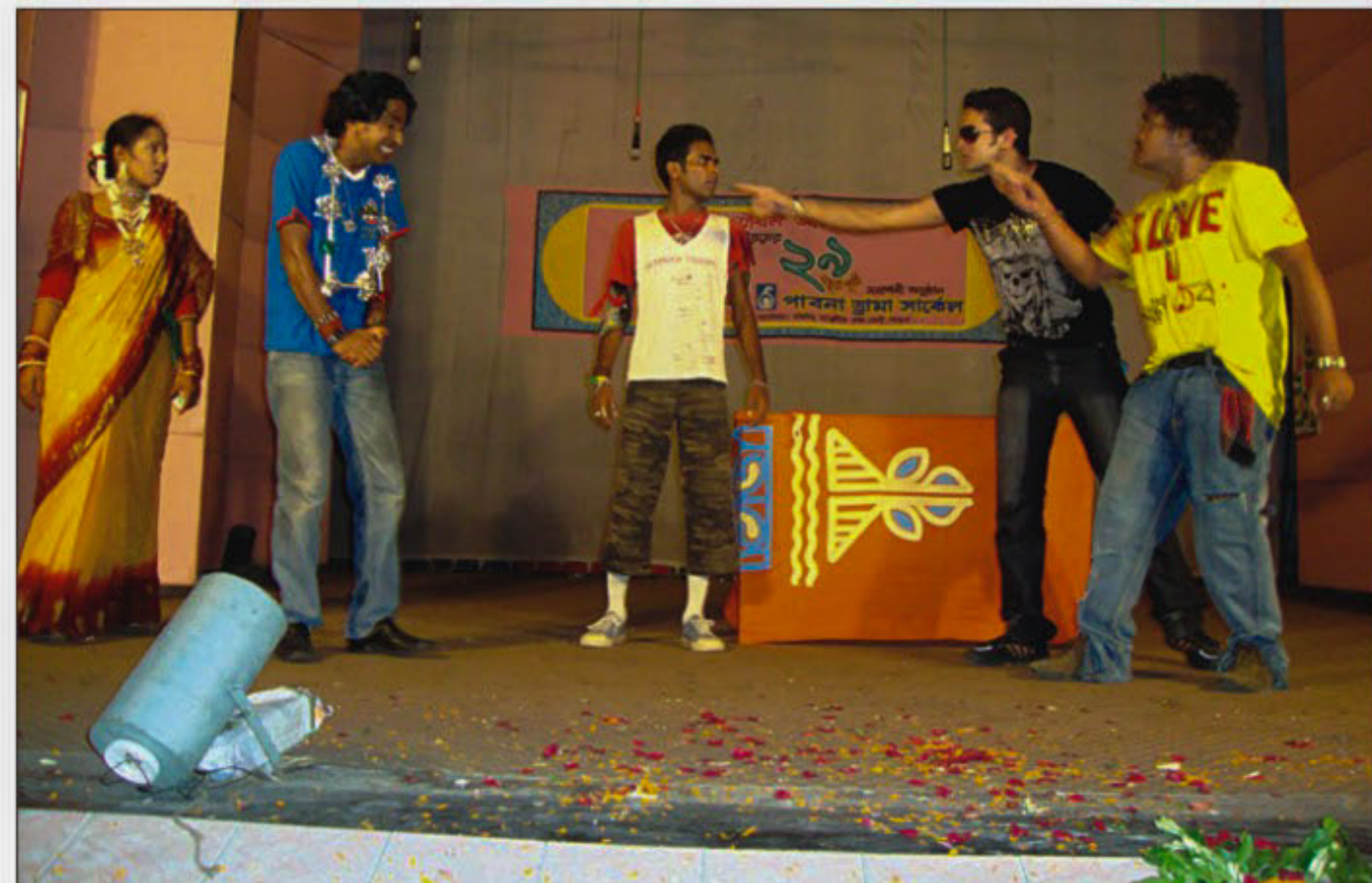
A scene from "Kistimat."