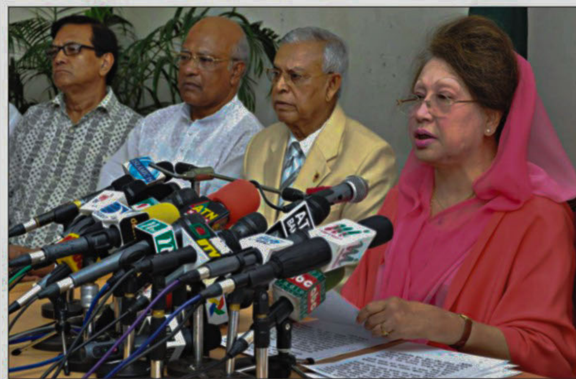
Leader of the Opposition in Parliament and BNP Chairperson Khaleida Zia speaks at a press conference at her Gulshan office in the city yesterday. (Story on Page 1)

Application was called for Jhilmil residential area in 2001. Over 600 people applied for plots. Of them, 20 were cancelled due to non-response from the applicants and finally published name of 585 allottees in the daily newspapers. Of them, 150 allottees had withdrawn their deposit due to delay.