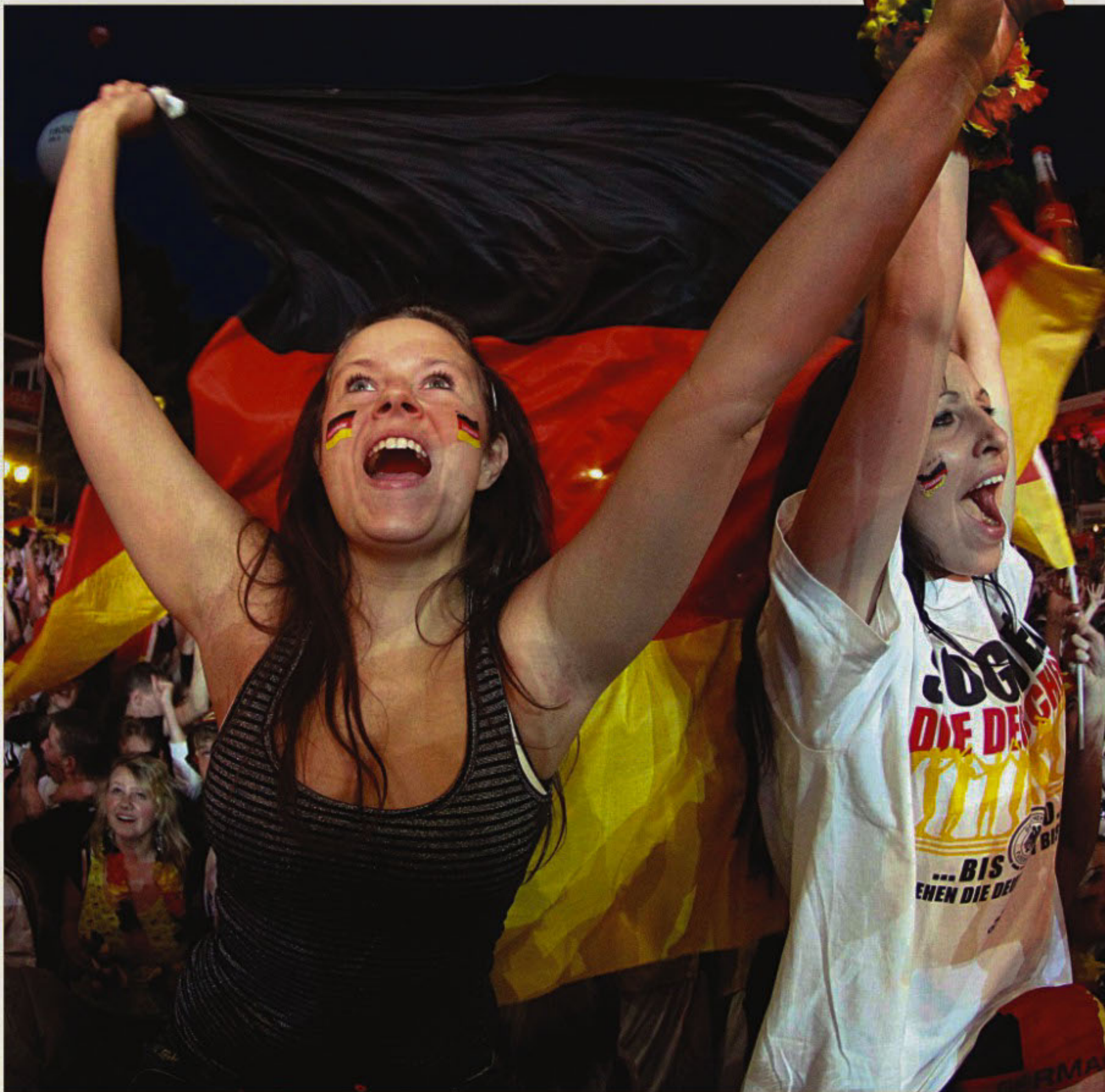
German fans celebrate in Berlin after their team's 1-0 victory over Ghana on Wednesday night.