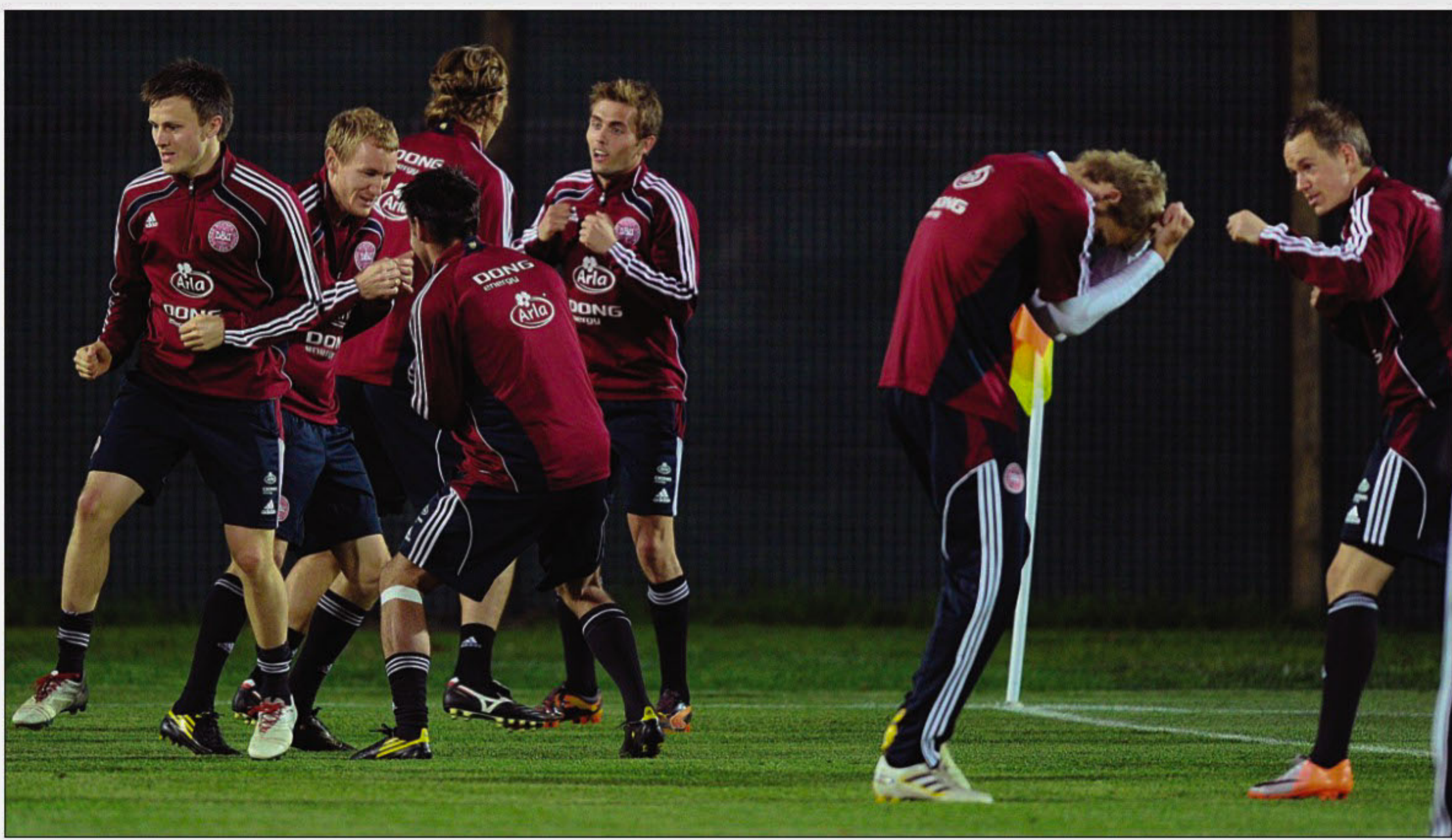
BATTLE MODE: Denmark players do a bit of shadow-boxing ahead of a training session at Loerie Park in Knysna on Monday. The Danes need nothing less than a win today against Japan for a second round qualification.

What they lack in experience and skill, the Kiwis make up for with spirit and self belief and, having already exceeded expectations, all the pressure will be on Paraguay.