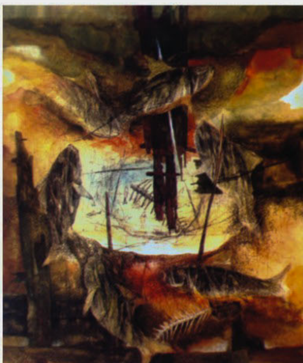
Journey-4 (mixed media)