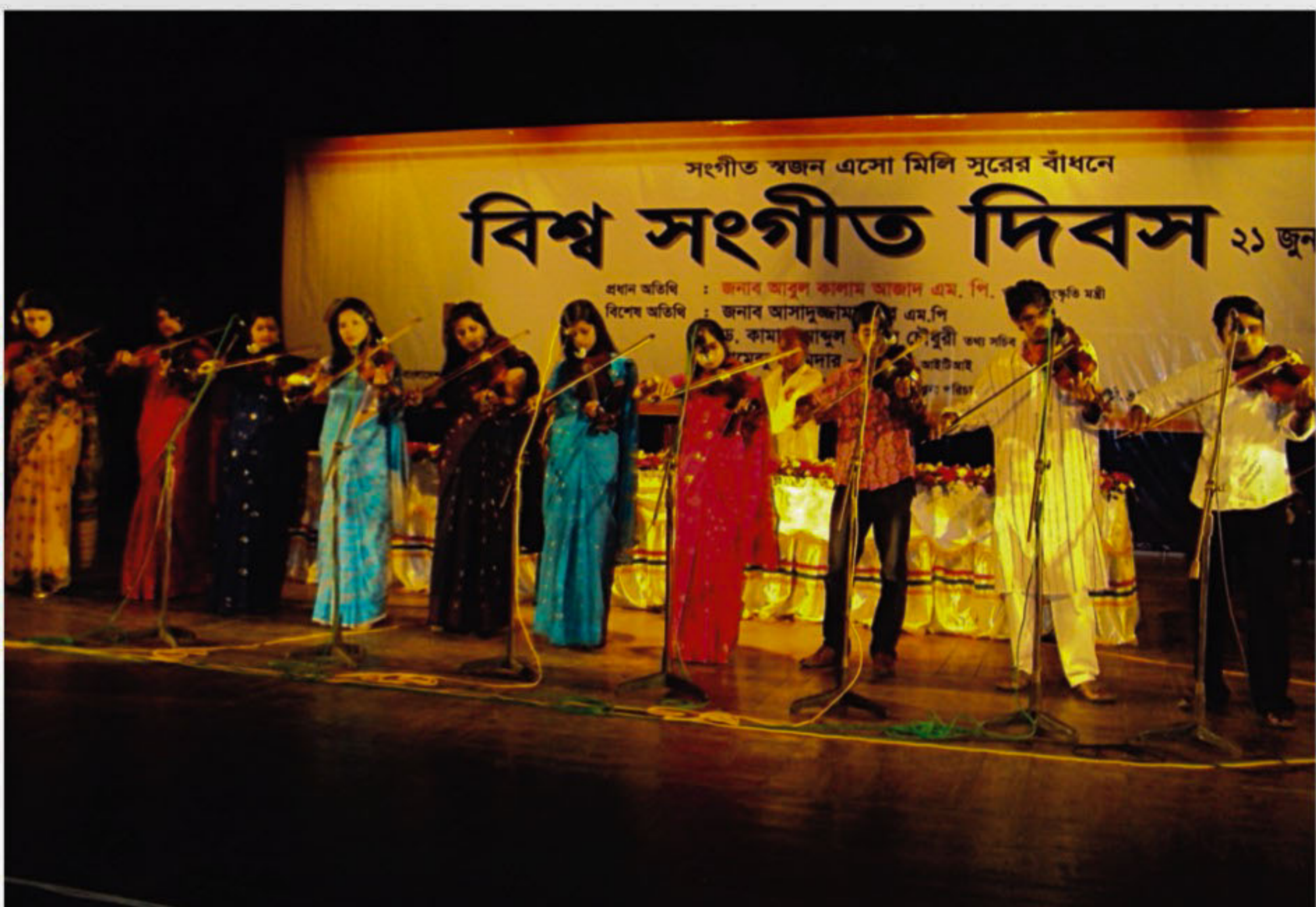
Artistes of Violin Association of Bangladesh perform at the BSA programme.

Galleri Kaya had previously held the first solo exhibition of Nagarbasi in 2005.