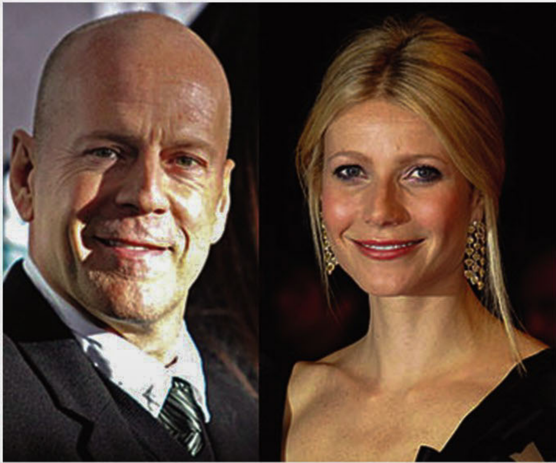
Bruce Willis and Gwyneth Paltrow

If rumours are to be believed, then you might see Gwyneth Paltrow, Bruce Willis and Bradley Cooper in the next M Night Shyamalan film.