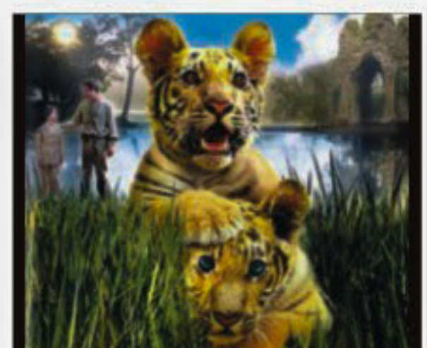
Two Brothers On HBO at 9:30 pm Genre: Drama Cast: Guy Pearce, Philippine Leroy-Beaulieu

10:00 Morning Express 12:00 My Time 01:00 No Tension 04:00 Dhaka Calling 09:00 Night Rider 01:00 Back to Back music abc radio fm 89.2 06:00 Bhorer Janalay 09:00 Mukhorito Jiboney 12:00 Darun Dupurey 03:00 Duranto Bikeley 05:00 Shondhataro 07:00 Shajer Maya 09:00 Raat-er Akashey 11:00 Golper Shesh Nei RADIO FOORTI 07:30 Hello Dhaka Talk show CHANNEL i 09:50am Grameenphone Tritio Matra 12:30pm Citycell Taroka Kathan 11:30pm Aloy-e Bhuban Bhora RTV 07:00 Road To Democracy Drama Serial ATN BANGLA 08:00pm Balasher Ghar 08:40pm Ognir Rath 09:20pm Shubarno Swapno CHANNEL i 05:30pm Fashion 07:50pm Mukim Brothers BANGLAVISION 08:15pm Pati Gonit 09:45pm Gulshan Avenue Rtv 09:00pm Tobuo Boshonto RADIO TODAY 07:15 Good Morning 11:00 Musti Unlimited 01:00 Today's Adda 04:00 U Turn 08:00 Tobey Tai Hok 11:00 Raat Bhor Gaan 12:00 Today's Happy Moments