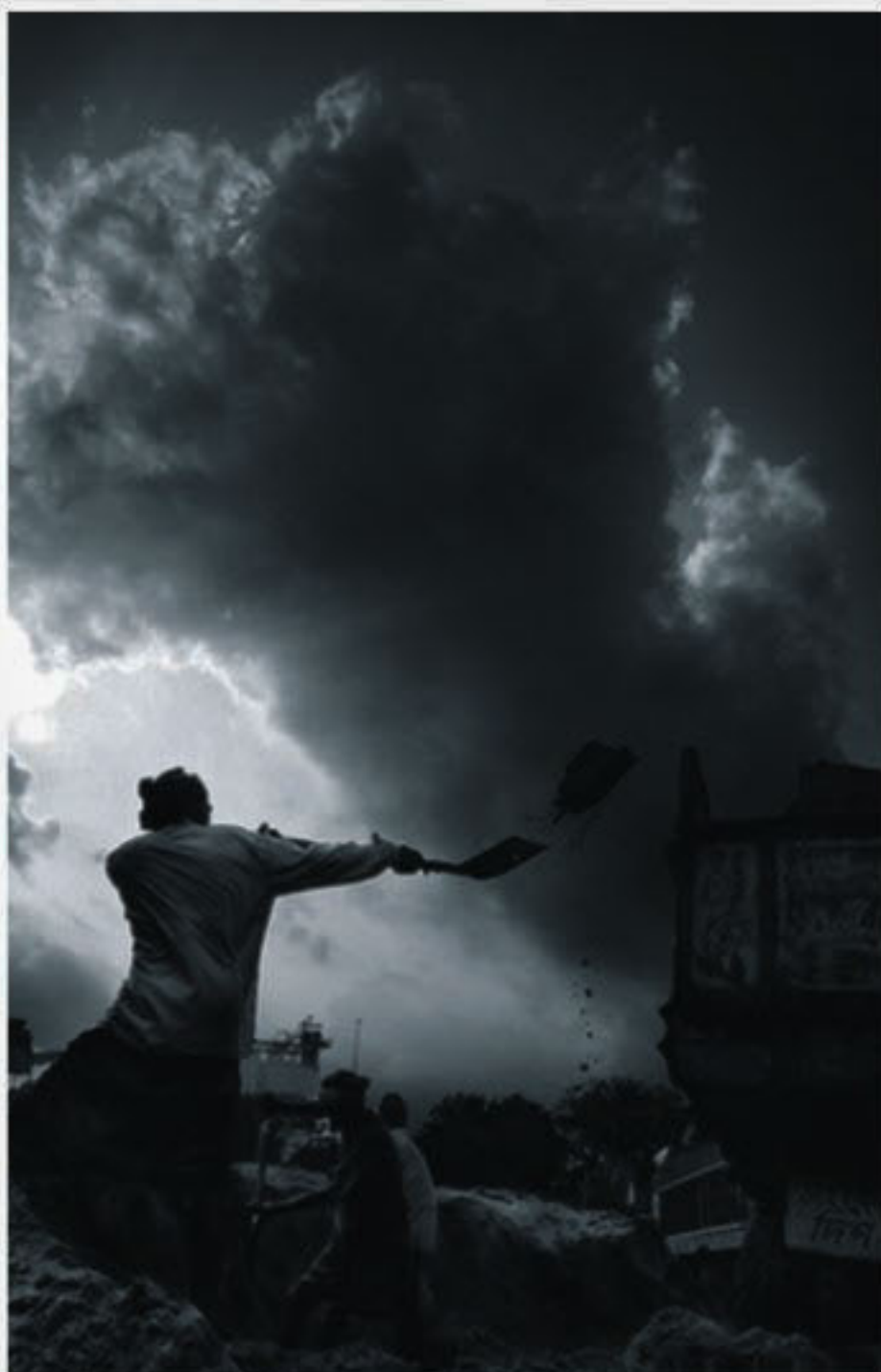
Through their works, the amateur photographers have tried to frame some glimpses of life, from various aspects.