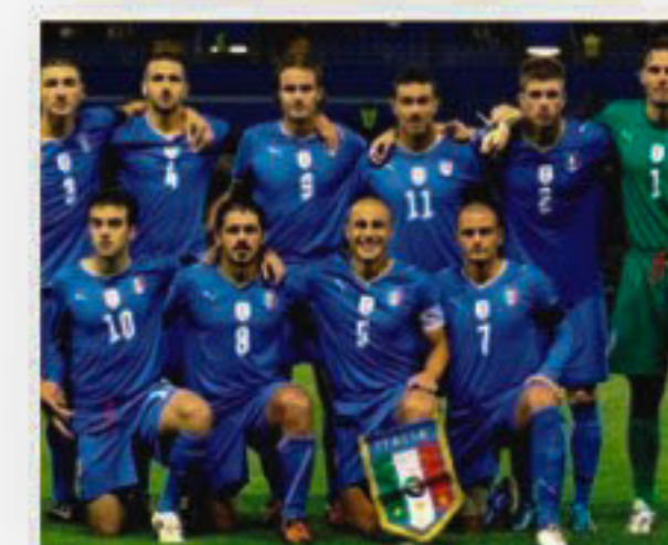
2010 FIFA World Cup South Africa On ESPN at 7:50 pm Match: Slovakia vs. Italy (live)

BTv News Headlines (Bangla) at 9:00 am. News (Bangla) at 8:00 am 2:00 pm, 5:00 pm, 8:00 pm. News (English) at 10:00am, 4:00 pm, 10:00 pm. Late Night News (Bangla and English) 11:30 pm. (To be telecast on all Bangla channels). CHANNEL-i News (Bangla): 7:00 am, 9:00 am, 2:00 pm, 5:00 pm, 9:00 pm, 10:30 pm, 12:30 am ATN BANGLA News (Bangla): 7:00 pm, 10:00 pm, 11:00 pm, 1:00 am, 4:00 am News (English) at 6:00pm News Every Hour: 7:00am, 11:00am, 12:00pm, 01:00pm, 3:00pm, 04:00pm News (English): 9:00 am, 6:00 pm. BANGLAVISION News (Bangla) at 7:30am, 1:30pm, 5:00pm, 7:15pm, 10:30pm. News Headlines (Bangla) at 10:00am, 12:00am, 4:00pm. Rtv News (Bangla): 2:30 pm, 4:30 pm, 6:30 pm, 8:30 pm, 10:30 pm, 12:30 am ntv News (Bangla): 7:30am, 12:02pm, 2:00pm, 7:30pm, 10:30pm, 1:00am ETV News (Bangla): 9:00am, 11:00 am, 1:00pm, 3:00pm, 5:00pm, 7:00pm, 9:00pm, 11:00pm abc radio News: 08:00 am, 12:00 pm, 03:00 pm, 06:00 pm, 09:00 pm, 12:00 am; English Bulletin: 1:30pm, 7:30pm