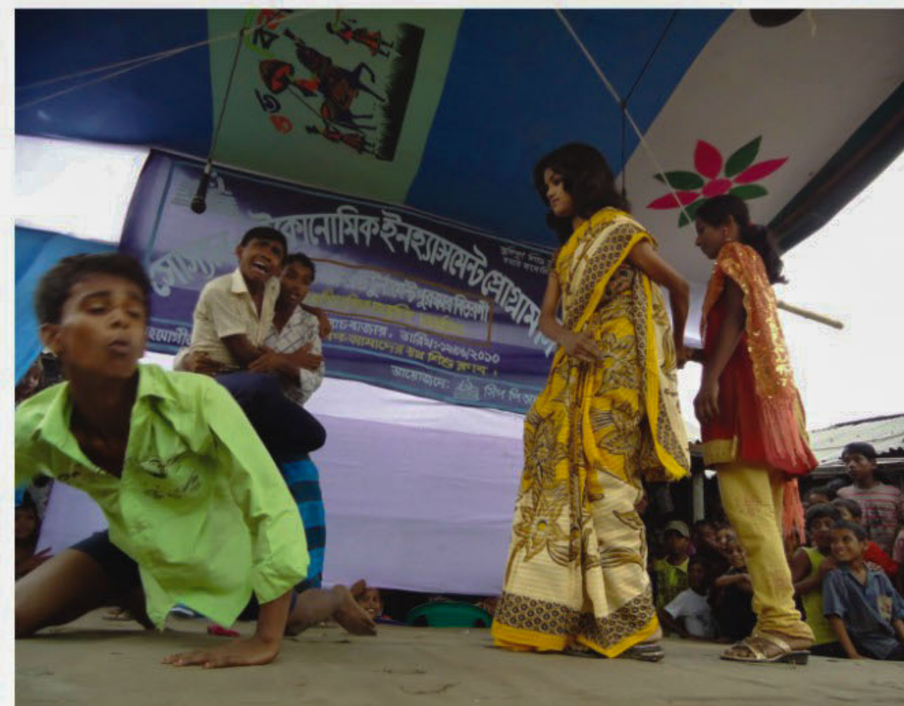
Child workers in the play "Bhul Thekey Shikkha"